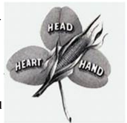
First Emblem Used Nationally (Created in 1907-1908, https://4-hhistorypreservation.com/History/Clover/ )

4-H. (n.d.) “4-H History”. Retrieved from https://4-h.org/about/history/