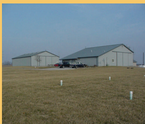
FACILITIES AT NEPAC

NEPAC is one of 8 Purdue Agricultural Centers across Indiana. Their purpose is to provide hands on research opportunities for specialists on campus to discover new information in the community so local food and fiber production can be improved and environmental quality maintained and improved.