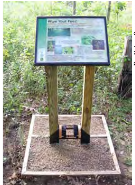
Boot brush station at entrance to nature preserve