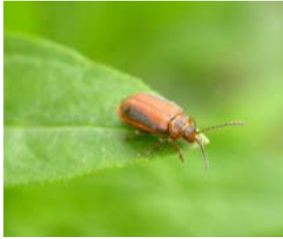
Scott Namestnik, JF New

FACT: There is no one miracle fix for controlling invasive plants. Relying on a single control method is unlikely to be successful. The best approach is an integrated management plan tailored to specific sites and species that includes a combination of methods appropriate to the situation, such as chemical control (herbicides), biological control (insects or pathogens), mechanical control (pulling or cutting), and prescribed burning.