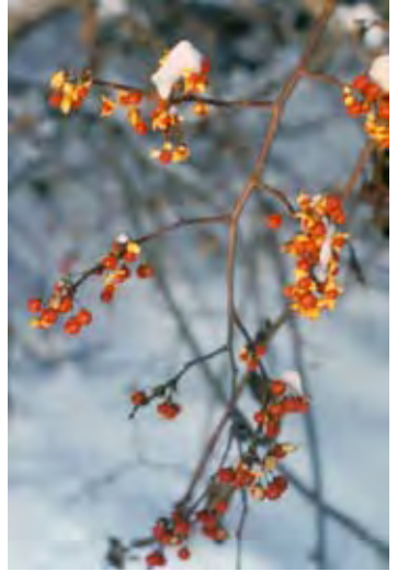
Eileen Jacquart, TNC

or killed by the vine, which constricts sap flow, weakens limbs and trunks making them more susceptible to wind and ice damage, and shades out leaves growing underneath it. Asian bittersweet is also able to hybridize with American bittersweet, altering the genetic make-up of the species and further reducing rare native populations.