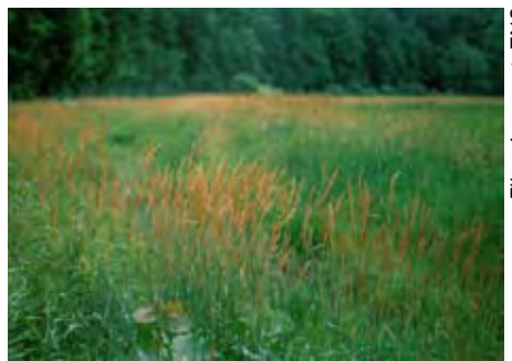
Ellen Jacquart, TNC

FACT: Many non-native species do not cause problems in the areas where they are introduced and can be important for agriculture, horticulture, medicine, or other uses. The species of concern are those that become invasive, taking over native ecosystems and crowding out native species. It is often difficult to know in advance if a new species that is introduced will become invasive, so great caution should be used when importing or planting new species.