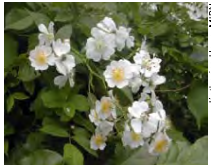
Katherine Howe, MIPN

natural areas. Multiflora rose is tolerant of a wide range of habitat conditions and grows aggressively once established. Multiflora rose can be distinguished from native roses by the presence of fringed stipules (small, green, leaf-like structures at the base of each leaf); stipules on native roses are not fringed.