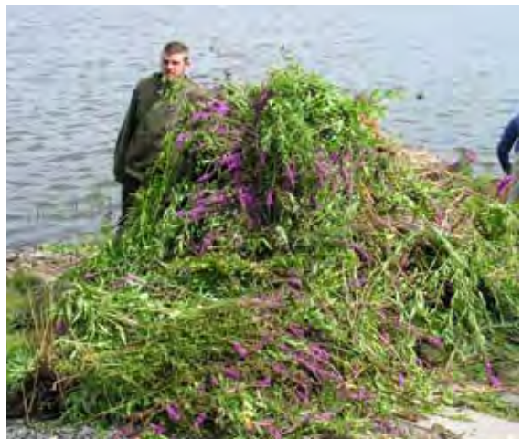
Purple loosestrife plants