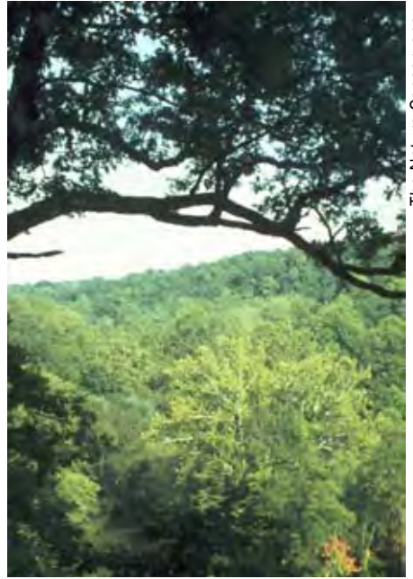
The Nature Conservancy

Since loggers and foresters rely on the long-term supply of forest resources, it is in their best interest to ensure the healthy regeneration of forest stands to native tree species.