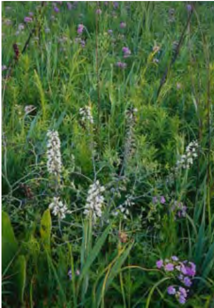
Native prairie plants

Natural scenic beauty sought by recreationalists is degraded by invasive plants, which often form single-species stands, displacing attractive native flowers. The annual trek to see spring wildflowers or hunt for mushrooms may be disappointing when none can be found in a sea of garlic mustard.