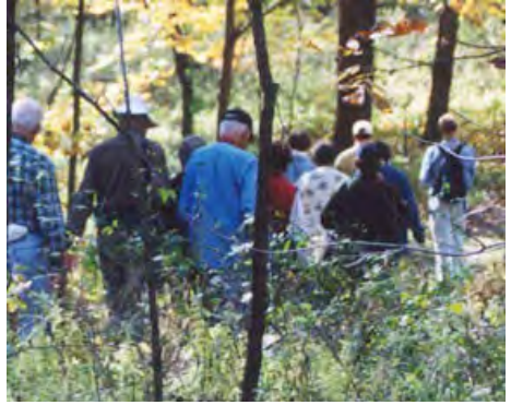
The Nature Conservancy

Invasive plants can affect your ability to enjoy natural areas, parks, and campgrounds. Hikers, cyclists, and horseback riders all enjoy well-maintained trails, and invasive plants can grow over trails to the point that the path cannot be followed or can be difficult to navigate through. Dried and dying knapweed plants catch in bicycle chains, slowing the rider and stirring up dust as they are dragged.