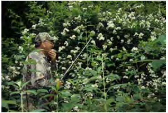
Gigi LaBudde, Bison Belly Futures

shade out oak tree seedlings and saplings and, over time, reduce the oak component of a forest. Fewer acorn-producing trees mean lower food availability and reduced habitat quality for wildlife such as white-tailed deer, squirrel, grouse, and turkey.