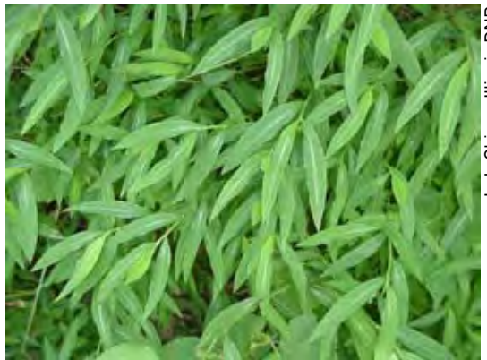
Jody Shimp, Illinois DNR

Japanese stiltgrass is an annual grass that thrives in forested areas with moist soils and along streambanks and ditches. It often makes its way into forests along trails or old logging roads and from there can rapidly spread into the forest understory, completely wiping out all other plants within just a few years. Stiltgrass has broad leaf blades that can be identified by the presence of a pale, silvery stripe of hairs along the middle of the leaf on the upper leaf surface. Japanese stiltgrass is abundant in the southern part of the Midwest region and is rapidly moving northward.