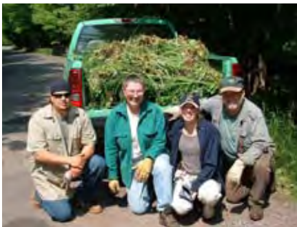
Hand-pulling invasive plants