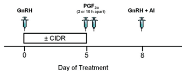
Figure 1: Experimental Design

Day 0: All cows received 100 µg of GnRH (Cystorelin®, Merial, Duluth, GA) and half of the cows received a controlled intravaginal drug releasing device (CIDR®, Pfizer Animal Health, New York, NY; 5 day CO-Synch + CIDR; n = 281) while the remaining cows did not receive a CIDR (5 day CO-Synch; n = 281).