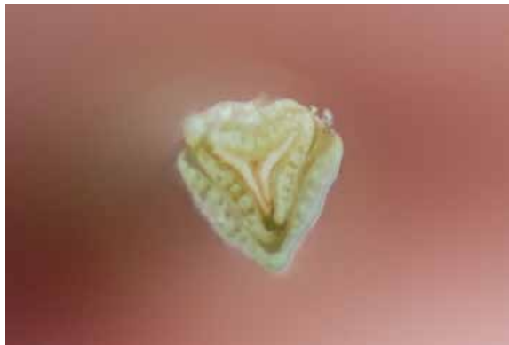
Figure 6. This cross-section of a yellow nutsedge stem shows its triangular shape.

soils remain moist from poor drainage or overwatering. However, yellow nutsedge can also be a problem in well-drained areas, especially thin turf (Figure 9).