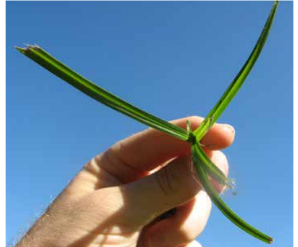
Figure 7. The three-ranked leaf arrangement of yellow nutsedge.

Herbicides may be required when large patches of nutsedge are present in the turf. The traditional herbicides used to control dandelions ( Taraxacum officinale ) and crabgrass ( Digitaria spp.) are ineffective since yellow nutsedge is a sedge and