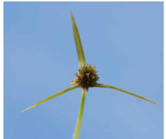
Figure 14. A seedhead typical of many kyllinga species.