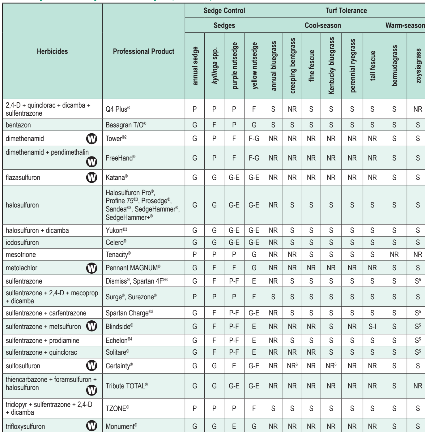
Table 1. Sedge control and turfgrass tolerance ratings for professional products 1 .