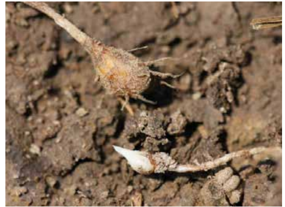
Figure 2. This image shows a mature yellow nutsedge tuber (the brown structure on top) and a yellow nutsedge tuber forming on the tip of a rhizome.

Yellow nutsedge is most problematic in turf that is mown too short, and it thrives in areas where