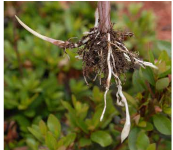
Figure 3. This yellow nutsedge plant is spreading both by a rhizome (left) and a tuber (the swollen rhizome tip at the bottom of the photo).