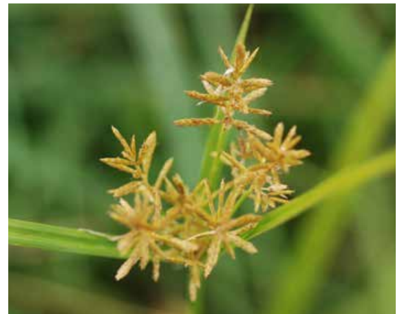
Figure 8. Yellow nutsedge produces golden seedheads.