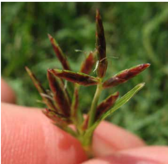
Figure 12. Compare the color of this purple nutsedge seedhead with the yellow nutsedge seedhead shown in Figure 8.

Annual sedge (Figure 13) and kyllinga (Figure 14) are smaller sedge species that have more compact seedheads. Like yellow and purple nutsedges, annual sedge and kyllinga can be identified by their triangular stems and three-ranked leaf arrangement. Annual sedge and kyllinga can also survive lower mowing heights than yellow nutsedge and can be found in golf course fairways, tees, and putting greens, as well as other turf areas.