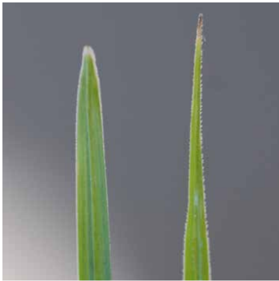
Figure 11. Purple nutsedge (left) has a blunt leaf tip, while yellow nutsedge has a sharply pointed leaf tip.

Purple nutsedge has darker leaf blades than yellow nutsedge, and has a more blunt leaf tip (Figure 11). Purple nutsedge has a purple- to maroon-colored seedhead (Figure 12).