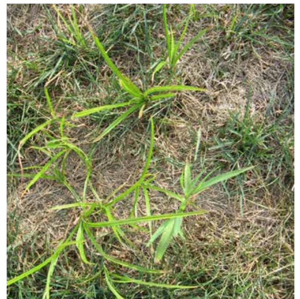
Figure 9. Yellow nutsedge can invade thin turf during the summer when turf is stressed.