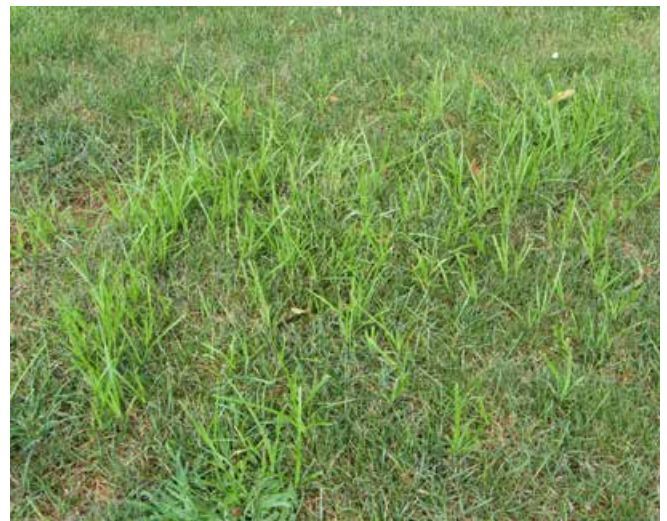
Figure 1. Yellow nutsedge is a problematic turf weed that is difficult to control.

Yellow nutsedge actively grows during the heat of summer when cool-season turf grows more slowly. Yellow nutsedge typically emerges (germinates from tubers) in the Midwest in late April or May (a few weeks after crabgrass germinates) and grows actively until the first frost in autumn (Figure 4). A frost will kill the plant's aboveground portion but the tubers will survive