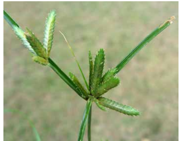
Figure 13. An annual sedge seedhead.

Cultural control practices for these other sedge species are limited, but similar to those of yellow nutsedge. Purple nutsedge, kyllinga, and annual sedge can be controlled with similar herbicides used to control yellow nutsedge, but purple nutsedge is more difficult to control with these products.