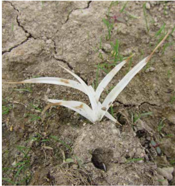
Figure 10. The bleaching effect caused by mesotrione application on a yellow nutsedge plant.

ance to all turf species. For best results, add 0.25 percent nonionic surfactant. Nonionic surfactant is a soap-like liquid that helps herbicide sprays better cover the leaf tissue and increase herbicide absorption to kill the weed. Expect to see injury to yellow nutsedge about two weeks after a halosulfuron application.