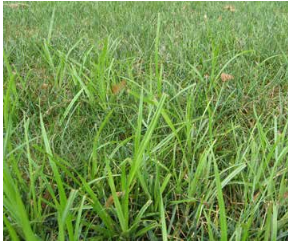
Figure 5. Yellow nutsedge grows taller than the surrounding turf during the summer.