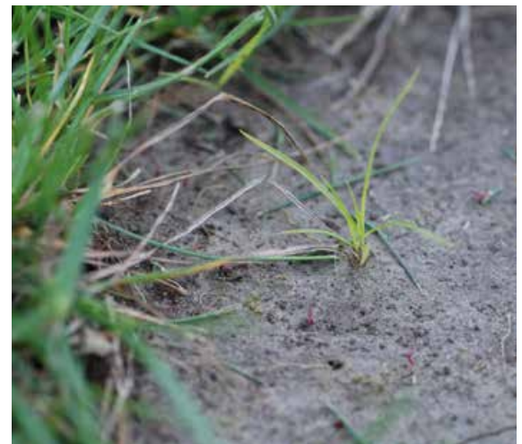
Figure 4. This yellow nutsedge plant was visible in April shortly after emerging in a bare soil area.