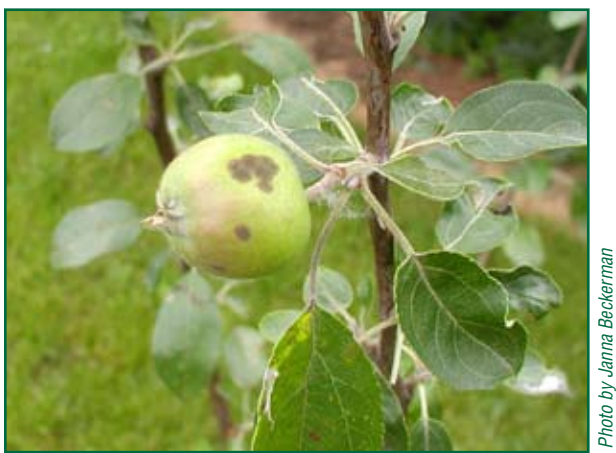
Figure 4. Early lesion development on a Honeycrisp apple. On fruit, maturing lesions often become corky, and crack.

fungicides. Often, proper crop management precludes the need to manage the disease. Management will be much simpler for growers who choose scab-resistant varieties than for growers who choose scab-susceptible varieties.