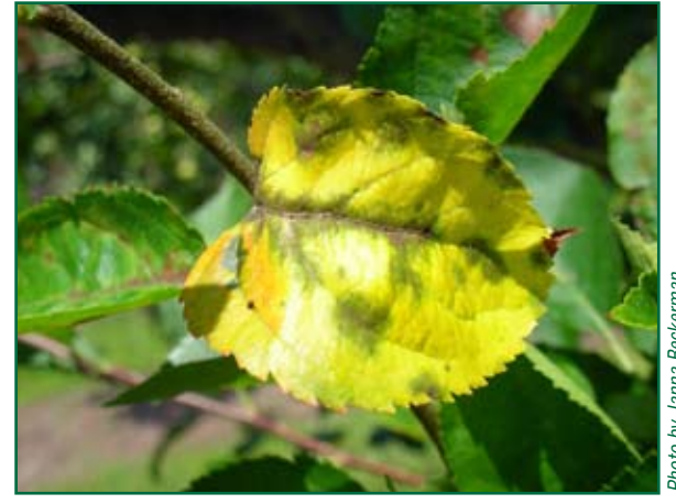
Figure 3. Yellow leaves characteristic of advanced apple scab.

Successful apple scab management requires an integrated approach that depends on the grower's goals. Such an approach combines resistant cultivars, good horticultural practices, sanitation, and fungicides. Growers must decide whether to manage their apples using natural fungicides (referred to as organic) or synthetic