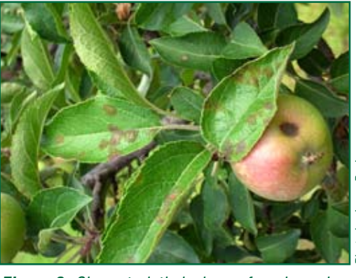
Figure 2. Characteristic lesions of apple scab on mature leaves.

corky. These lesions are often smaller, have distinct borders, and enlarge more slowly than foliar lesions. Early season infection can cause uneven, cracked, or deformed fruit. Late summer fruit infections may not be visible until the fruit is in storage. Although unusual, fruit may drop if an infected pedicel becomes girdled.