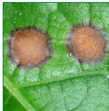
Figure 2. A rust disease on a hollyhock leaf.