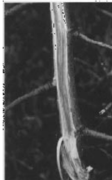
Figure 2. Brown discoloration just beneath the bark is typical of internal symptoms of Dutch elm disease.

Systemic fungicides are most effective when used in conjunction with other management practices.