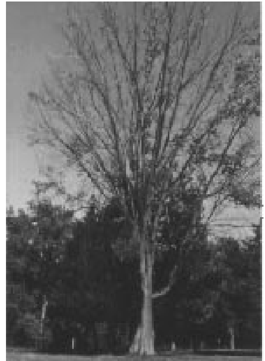
Figure 1. Remove and dispose of all diseased trees, regardless of cause.

The disease results in wilting and yellowing of the foliage, followed by leaf death, defoliation and death of the affected branches. Wilting and yellowing of the leaves usually becomes visible about mid June and are most evident during July and August. Brown streaks develop under the bark in the sapwood of infected branches. This may be seen as a ring of discoloration when a diseased branch is cut or as dark streaks when the bark is peeled back from the infected branch (Figure 2).