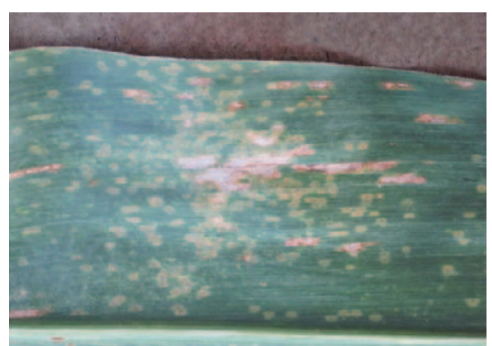
Figure 2. (Top) Southern rust pustules are orange to light brown, small, and densely packed on the upper leaf surface. (Above) The lower leaf surface of this plant has yellow flecks, but very few pustules. This feature distinguishes southern rust from common rust.