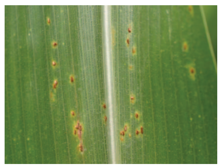
Figure 1. Common rust pustules are brown to brownish red, elongated, and scattered on the leaf surface.

Common rust pustules appear on upper and lower leaf surfaces. They are typically brown to brownish red, elongated in shape, and scattered on leaf surfaces (Figure 1).