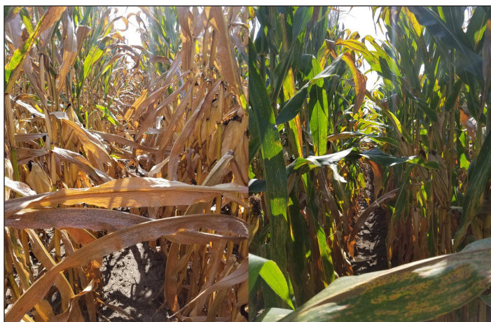
Figure 5. Both hybrids infected with tar spot were in adjacent plots. The hybrid on the left had increased tar spot severity (>40%) leading to rapid senescence, while the hybrid on the right had decreased severity (25%) and remained green longer.

Tar spot is considered the most important foliar disease in Latin America, particularly Mexico. In Mexico and Central America, P. maydis is not widely considered to cause economic damage when present alone, although there were isolated reports of damage in old literature. However, significant yield losses were reported from the tar spot complex, consisting of P. maydis and another fungus ( Monographella maydis ) associated with tar spot.