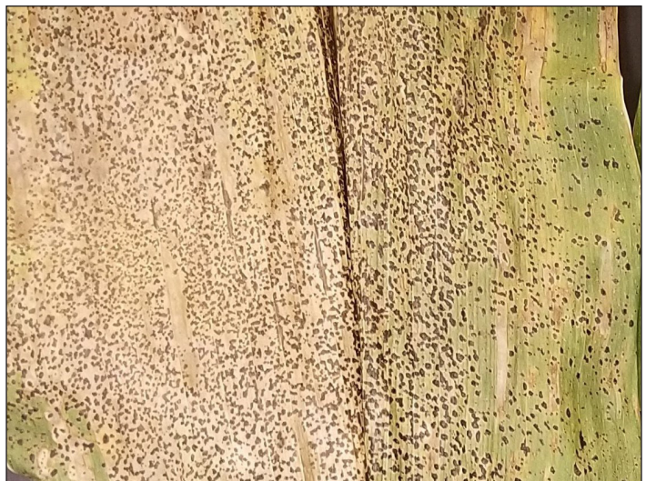
Figure 4. Leaves affected by tar spot can have densely packed fungal structures.