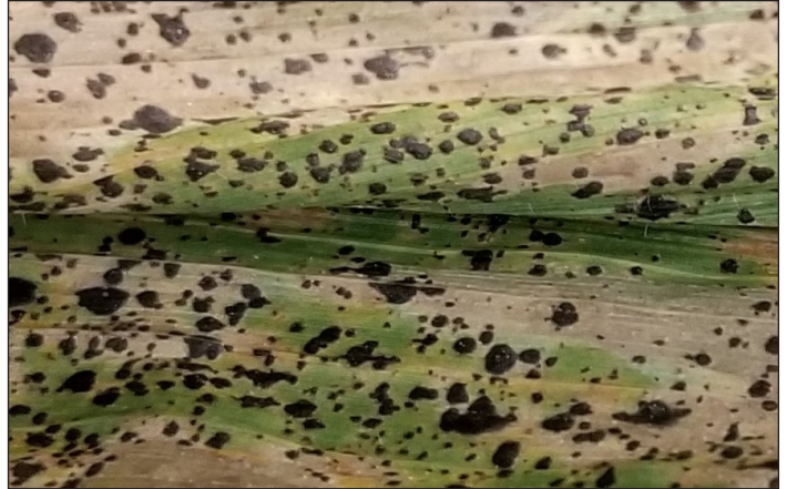
Figure 2. The tar spot fungus Phyllachora maydis produced raised, black fungal structures called stromata on leaves, stem, and husk of the affected corn plant.

The fungus that causes tar spot is an obligate pathogen and requires a living host to grow and reproduce. Researchers believe that the fungus is surviving over winter in Indiana on infected corn debris on the soil surface within stromata. Other fungi related to the tar spot fungus overwinter in a similar fashion by infecting grasses and weeds. It is unknown how long the fungus will survive in this debris outside