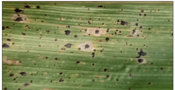
Figure 3. Tar spot stromata can be surrounded by a narrow tan halo.