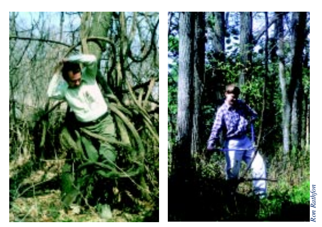
(Left) Though usually not a threat to people, out-of-control grapevines wreak havoc on trees. (Right) Cutting grape vines may be the most beneficial thing you can do to promote the growth of quality timber, and it can be done without special training and equipment.

Grape vine control is one of the simplest and most productive practices to improve growth and quality of trees. Left uncontrolled, grape vines grow over the tops of trees, shading them out, deforming them and even breaking their crowns. Vines should be cut at least two to three years prior to a timber harvest. This eliminates the need to spray herbicide on the vine stumps. If vines are cut immediately prior to or following the harvest of