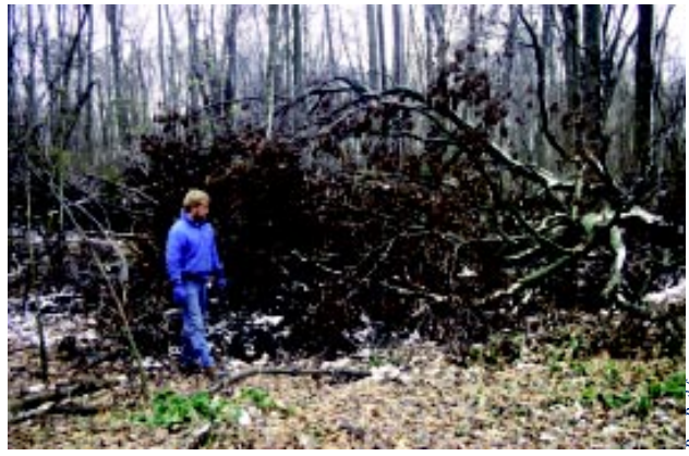
Tree tops left after logging is complete may affront our sensibilities, but they contribute nutrients to the soil and provide habitat for wildlife.

Dead wood from limb fall, natural death of trees, and from logging or other forest management activities contributes to soil building in the forest. Although not as high in plant nutrients as leaf matter, it provides a rich source of carbon for building up soil organic matter. Such organic matter has the ability to absorb and hold large quantities of water and nutrients for later uptake by tree roots. It forms miniature dams on the soil surface to slow surface water runoff and trap sediment. Dead wood, in the form of standing dead trees, called snags , and fallen logs, also provide wildlife habitat. See Purdue Cooperative Extension Publication FNR-102, Woodland