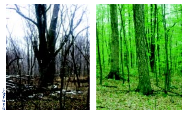
(Left) This woods in northern Indiana was poorly managed in the past. Timber stand improvement will help bring it back into full productivity. (Right) A well-managed forest grows high-quality timber.

Grape vine control is one of the simplest and most productive practices to improve growth and quality of trees. Left uncontrolled, grape vines grow over the tops of trees, shading them out, deforming them and even breaking their crowns. Vines should be cut at least two to three years prior to a timber harvest. This eliminates the need to spray herbicide on the vine stumps. If vines are cut immediately prior to or following the harvest of