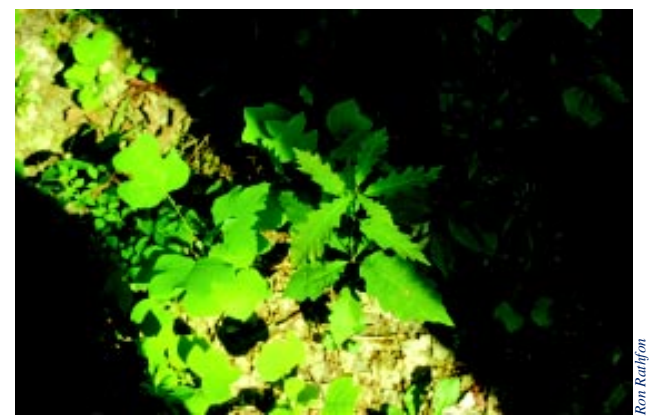
Regenerating a forest is its renewal with new, young trees.

Nature accomplishes the regeneration of a forest through wind, ice, tornado, insect, disease, fire, or natural death. Sustainable forestry mimics natural disturbance, with foresters using professional judgment and experience based on scientific research rather than nature's randomness. Foresters carefully plan and select the right trees to remove in a timber harvest to stimulate desirable regeneration, as well as achieve other management goals.