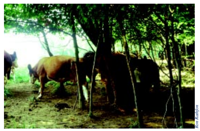
Fencing livestock out of the forest prevents soil erosion and compaction and damage to tree roots and bark.

nutrients. Damage to roots and bark weakens the tree and leaves it vulnerable to insects, disease, and decay.