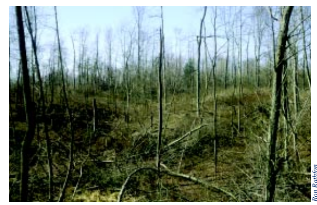
Diameter limit cutting often results in a forest of stunted, slow growing, low vigor, poorly formed trees.

The best protection against high grading and diameterlimit cutting is learning how to properly market timber marked for sale using sustainability guidelines. A forester can help ensure the right trees are harvested in order to regenerate the forest and meet your other objectives. Additionally, a forester can provide timber