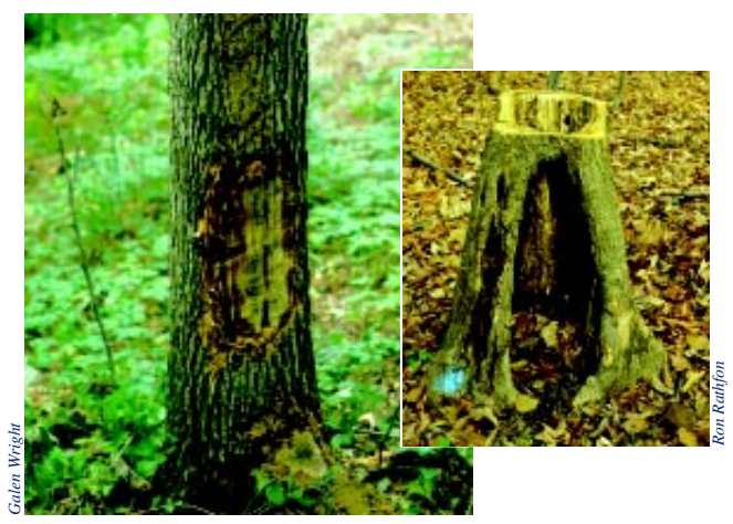
It requires great skill to remove long logs from the forest with large skidding equipment without doing a lot of damage to the remaining trees. Such damage to a tree's bark allows wood boring insects and decay fungi to attack and destroy the interior wood and weaken the tree.

trees from damage caused by falling trees and heavy equipment. Well-trained, conscientious loggers and a good timber sale contract minimize such damage. Employing the services of a professional forester can help ensure a good logging job. You may request that