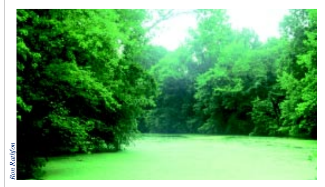
Only uniquely adapted tree species thrive in the frequently flooded environment along our large rivers and associated wetland environments like this oxbow on the Patoka River.

Basing forest management decisions on this knowledge and working with nature results in healthy forests,