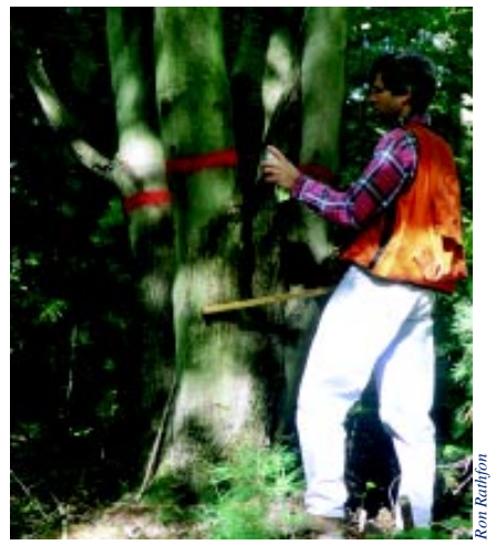
Foresters need the flexibility to mark for harvest some small, defective, poor vigor trees, and to leave some large, healthy trees in the forest.

leaving poor quality, low vigor or decadent trees of less desirable species. All too many Indiana forests have the oak, tulip poplar, walnut, and cherry logged out, leaving slow growing, stunted hickory and maple, hollow beech, and crooked elm. All these species have their rightful place in a sustainably managed forest. However, if they are the only species left, or if most remaining trees are in poor health or form, the forest has been degraded.