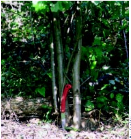
Stump sprouts are often an important part of forest regeneration.

Timber stand improvement should be done immediately following a timber harvest. Undesirable, poorly formed, low vigor, defective trees that are competing with crop trees should be cut or killed. Regeneration openings where groups of trees have been harvested should have remaining trees cut or killed to complete the opening and allow full sunlight to reach the regeneration. In these openings, trees of desirable species, but perhaps less desirable form (crooked, twisted, stunted, etc.), can be cut close to the ground. This usually stimulates