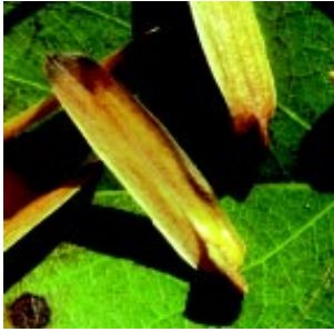
Tulip tree seed

A mature tree is the product of its heredity and environment. The embryo curled and folded inside a tulip poplar seed