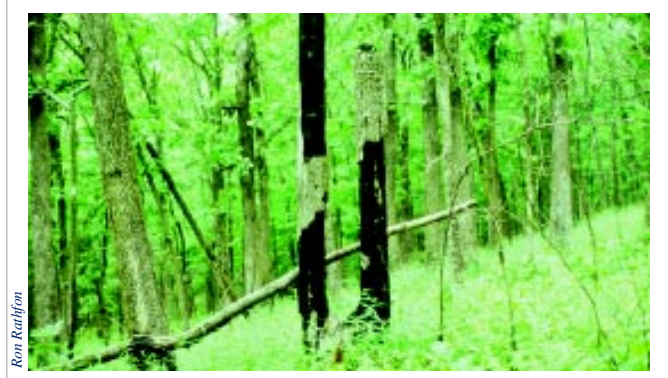
Forests growing on shallow, rocky soils on south-facing slopes, such as this post oak glade in Perry County, indicate a dry site.

Trees, like all other green plants, require sunlight, heat, water, nutrients, and space to thrive. Environment determines the availability of essential requirements. Foresters refer to this availability as site productivity . Heredity determines the individual tree's ability to use its environment as it competes for survival.