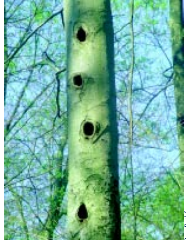
No need to fret over an occasional dead or dieing tree; nature will put it to good use as with this wildlife apartment house.

owners regard this slash as unsightly and want it removed. Conveniently located tops can be cut for firewood, but the remainder should be left in place to build soil and provide wildlife habitat. Part 6 of the Sustainable Forestry series, entitled Maintaining the Aesthetic Beauty and Enhancing the Recreational and Cultural Values of Your Forest (FNR-185), discusses logging aesthetics.