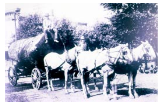
Most of Indiana's old growth timber, like this large log being brought to a mill in Jasper, has been cut (ca. 1900). Virtually all timber cut today is second growth.

Forest researchers and the lumber industry have documented the decline in timber quality over the last century as the last of the old growth hardwood timber has been cut. Today, nearly 100% of the timber harvested in Indiana is second growth; i.e., timber that grew up following previous logging. This second growth timber is generally of lower wood quality than previous generations of timber, largely because we don't let it grow 150 to 200 years before harvesting it. The average harvesting age in Indiana is closer to 70 to 90 years old. Because