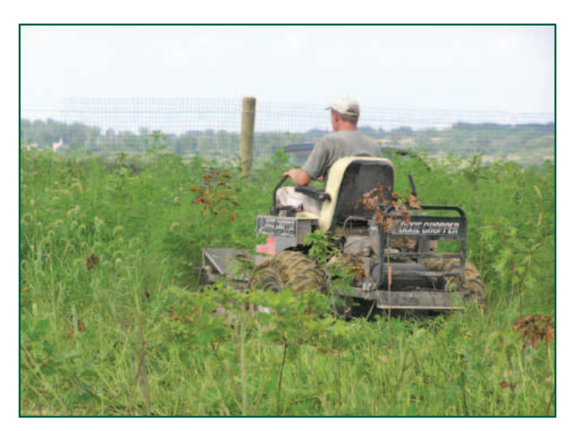
Figure 3. Frequent mowing between planted rows can be a simple, effective means to reduce competition for seedlings.