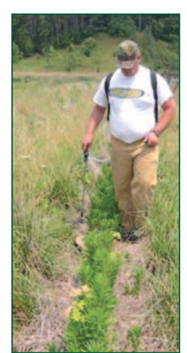
Figure 9. Backpack sprayers can allow for a more controlled application of herbicides.