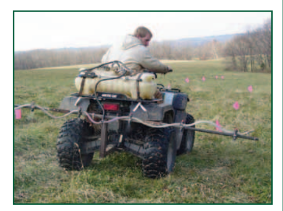
Figure 8. ATV with mounted boom sprayer can be very useful for small planting areas or uneven terrain.

with a tractor-mounted boom sprayer (Fig. 7). Broadcast application may also be achieved aerially with a helicopter, but this is less common as plantations must be of adequate size to make this economically practical (generally greater than 50 acres) (Miller 1993). ATV-mounted boom sprayers may also be used for broadcast applications. While an ATV's boom size may be limited, ATV's are often better suited than tractors for handling rough terrain, tight rows, and small fields.