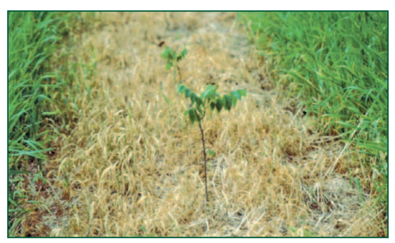
Figure 6. Post-emergent herbicides are applied directly to the vegetative foliage of actively growing weed competition. A properly timed application prior to bud-break of crop trees, but while competitors are actively growing, can be very effective in controlling competition.