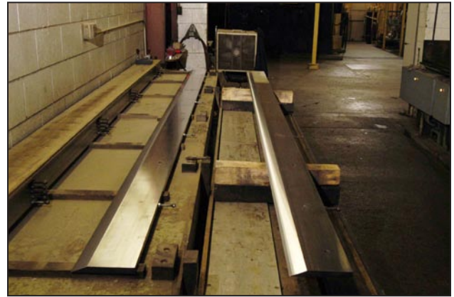
Figure 7. Knives used for slicing veneer are razor sharp.

flooring, pallet liners, drawers sides or other applications. The veneer knife may be up to 18 feet long (Fig. 7).