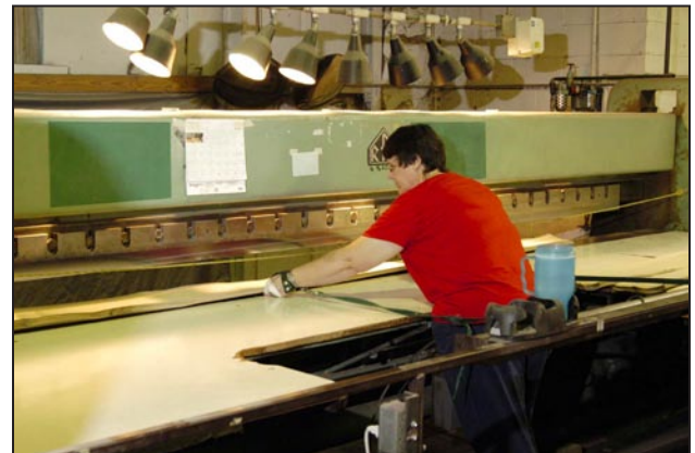
Figure 14. Guillotine used for clipping the edges of veneer and also for removing major defects. A second machine is usually used for end clipping as well as defect removal. Note the safety device used to prevent the operator from accidentally over extending his or her reach. The machines are usually equipped with lasers to show exactly where the cut will be.

As each sheet of veneer is sliced from the flitch, it is kept in order. This enables the flitch to be laid out and used one sheet at a time for producing panels or other products where a repeating grain pattern is desired. For domestic veneer, three sample sheets of veneer are generally “pulled” from each flitch. These samples are located near the outer 1/3, middle, and inner 1/3 of the flitch and should represent the overall quality to a prospective customer. More sample sheets may be pulled on larger