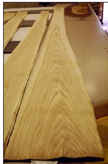
Figure 8. “U” or “V” shaped grain pattern typical of flat sliced veneer. The species is white oak.

The way a flitch is sliced is affected by the species and the grain pattern desired. For most species, the log is simply cut into halves. Each half is then sliced from the outside of the log to the very center. As the slicing operation proceeds deeper into the half log, the grain pattern changes significantly. A V- to U-shaped cathedral pattern is produced on the outside (Fig. 8). As the process continues and the direction of the cut to the annual growth rings changes, the cathedral effect is lost, and a straighter, less showy grain pattern develops. The veneer sheets are all kept in sequenced order from beginning to end. This allows matching of veneers to provide a decorative affect.