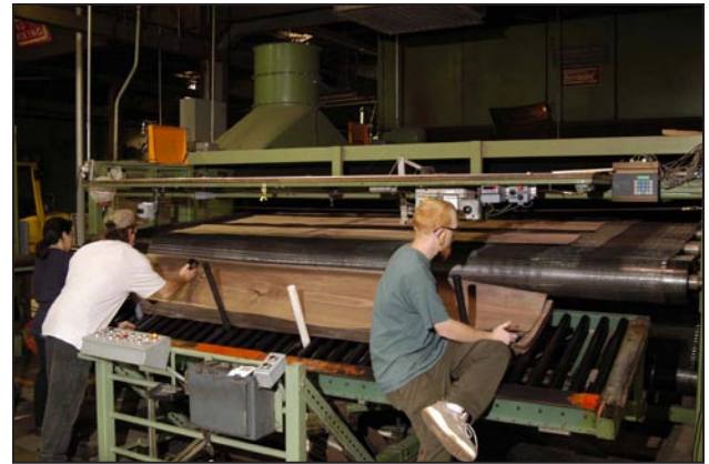
Figure 13. Outfeed end of veneer drier. Each sheet of veneer is still in the order of which it was originally sliced. Sample sheets are pulled from each flitch at this point. The moisture content of the veneer is being checked by the person in the middle.