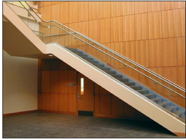
Figure 16. Cherry paneling in a public building. In high end applications the sheets could run the entire height of the room and be consecutively matched from one side to the other.

are preferred. Flitches are often individually selected by the architect or designer.