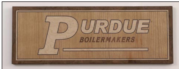
Figure 1. This laser cut plaque uses rift cut cherry veneer as a background and burl walnut as the outer border. The black inner border and black outline around the lettering is dyed yellow poplar. The Purdue lettering is birdseye maple. The plaque was manufactured by Custom Plywood, Inc., New Albany, IN.

The selection and use of wood as a veneer in some applications is an art form dating back to the days of the early Egyptians. Today, veneers are laid up in panels to take advantage of their unique patterns and colors. They can be laser cut to produce the most intricate of designs (Fig. 1). In other current applications, veneer is used for the mass production of products, so uniformity, rather than uniqueness, becomes important. Regardless, growing veneer quality trees provides landowners with an opportunity to generate substantially more value from a timber stand than would otherwise be possible with only sawlog-quality material.