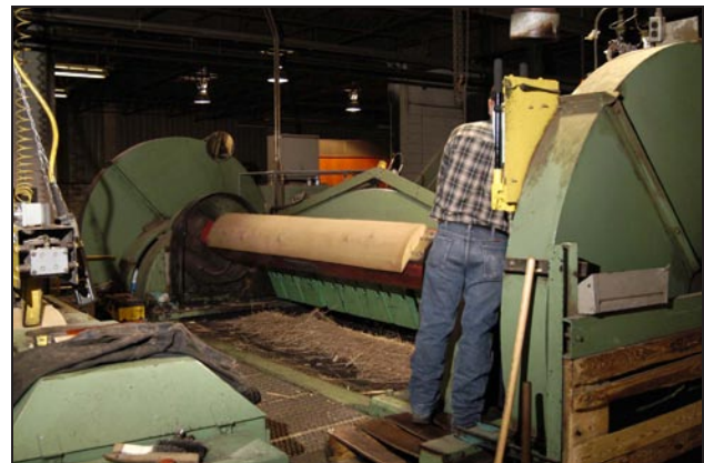
Figure 11. Half-round veneer slicing machine.

The third way in which hardwood logs are cut into veneer is on a half-round machine (Fig. 11). With this method, a half log or flitch is dogged or secured in place and turned 360° against a stationary knife. As a result the log is cut somewhat – but not completely – along the circumference.