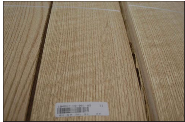
Figure 10. Rift cut veneer from white oak.

With equipment improvement, veneer thicknesses have decreased or become thinner over the years thus, extending the resource. Veneer thickness generally ranges from 1/36 to 1/50 of an inch. The thinner or 1/50 inch