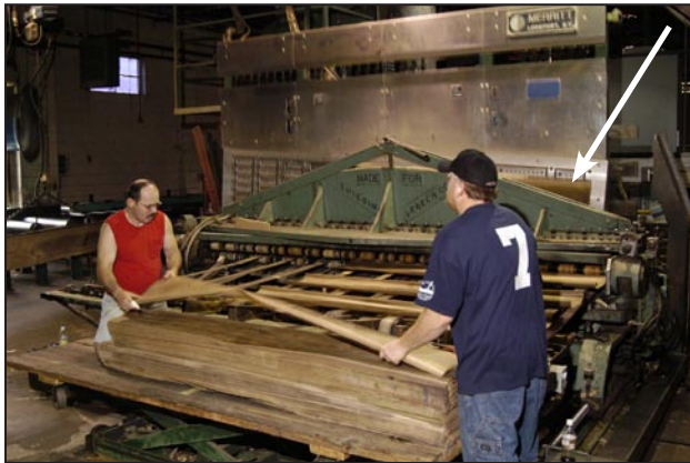
Figure 5. After cleaning, the flitches are sliced into veneer. The flitch (upper right corner) is dogged and moved up and down against a stationary knife. The resulting sheets of veneer are stacked in order.

After heating, the flitches are cleaned and brought to the slicing machine (Figs. 5, 6). The flitch is then held by hydraulic dogs and or vacuumed (dogged) in place on a metal frame, which moves down against a knife, and a thin sheet of veneer is “sliced” loose. After all slicing