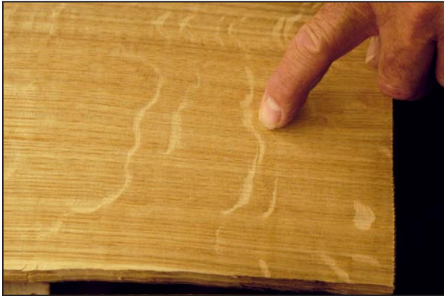
Figure 9. Quartered pattern showing ray flecks in white oak veneer.

With oak, the log may be sawed into true quarters and the veneer sliced parallel to the wood rays. The rays appear as large shiny splotches. This wood is said to be “quartered” and in (Figure 9 shows an example). The log may also be processed in such a way that the veneer knife intersects the wood rays at a 45° angle.