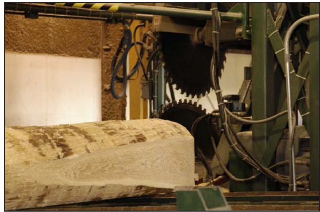
Figure 2. Circular head saw and top saw used to flitch logs for veneering. Band saws are also commonly used. In the simplest process, two opposite faces of the logs are lightly slabbed. The log is then cut through the middle producing two flitches for slicing into veneer.

Flat slicing is the method used to produce decorative face veneer. Face veneer is applied to the exposed surface of the panel. It must be aesthetically pleasing and is usually of the highest quality. This veneer is produced by first cutting the log in halves or quarters (Fig. 2), or sometimes other proportions, each piece being called a “flitch” (Fig. 3). The flitches are specially cut from the log to produce specific grain patterns. The flitches are heated in water vats (Fig. 4) to soften the wood, making it easier to slice or cut. Heating or cooking schedules are dependent upon species and may vary by manufacturer.