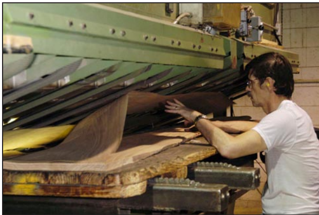
Figure 12. Infeed end of a veneer drier. A vacuum is used to help assist the operator in lifting each sheet into the drier. The driers are usually a 125 to 150 feet long.

After the veneer is sliced, it is generally dried to a 7-12 percent moisture content for domestic use and 12-18 percent for the export market (Figs. 12, 13). Over drying will make the veneer brittle and hard to handle without causing damage. Buckle also increases as the moisture content is reduced. For the domestic market, the ends of the veneer are clipped, and light edge clipping may also occur (Fig. 14). The square footage of veneer in each flitch is measured for pricing purposes. With large or exceptional logs, which contain two or more flitches, the flitches are often numbered consecutively so they can be kept together and sold as one lot. The veneer is then bundled in crates, ready for shipment on the domestic market.