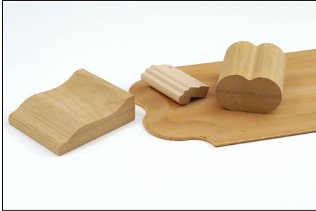
Figure 17. New technologies in using veneer have extended the resource substantially. Pictured here is veneer wrapped on a reconstituted wood product and used as molding. A veneered raised panel door is also shown.

medium-density fiberboard. The veneer is then glued or wrapped to the contour of the molding. This product is an excellent substitute for solid wood moulding. Veneer for this application must yield long clear cuttings of at least six feet. These pieces are then jointed together and glued to a backer sheet and wrapped into long rolls for the customer.