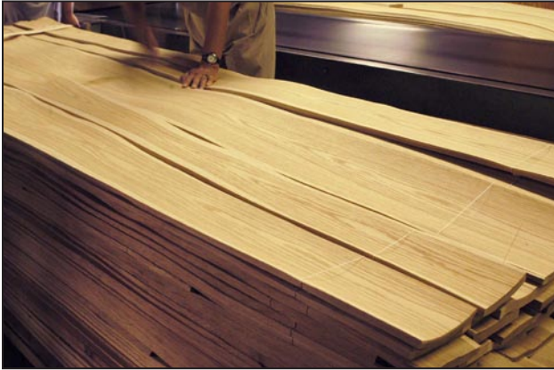
Figure 15. High quality white oak veneer prepared for the export market. Rough edges, ends, and other major defects have been removed.

For the export market, the rough or waney edges along the lengths as well as the ends and any other major defects in the sheets are clipped before measuring and packaging into bundles of 24 sheets each (32 sheets for quarters) (Fig. 15). Each flitch is still kept together.