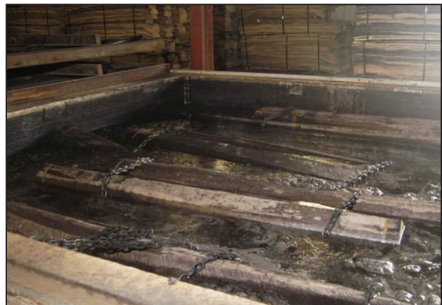
Figure 4. Veneer flitches being heated in hot water to soften the wood.