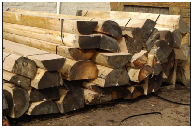
Figure 3. The flitches are banded on the ends to prevent splitting and heated in vats to soften the wood.