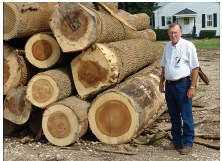
Figure 4. These yellow-poplar logs show a wide sapwood band and brown heartwood. Logs of this excellent size and quality are commonly available.

In terms of its availability and properties, yellow-poplar is a very viable resource when compared to the traditional western softwoods, including Ponderosa and Jeffrey pines. See Table 1 for a comparison of lumber prices.