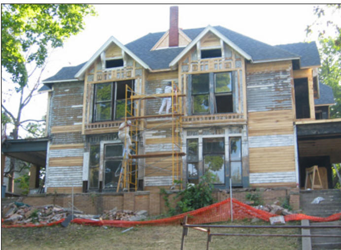
Figure 3. This 1880s Midwestern house originally used yellow-poplar for siding and architectural adornment. Restorers replaced about one-third of the siding with a mix of yellow-poplar sapwood and heartwood.

As we enter the 21st century, those high-quality old-growth sources of redwood, cypress, and western red cedar lumber are in short supply and costly. Much of today's redwood, cypress, and western red cedar lumber is coming from second- or third-growth stands that contain substantial amounts of white sapwood, making them susceptible to decay and insects. In the mean time, however, the yellow-poplar resource has recovered and plentiful supplies of relatively inexpensive lumber are available. And because yellow-poplar was once an excellent species for exterior millwork, many individuals are again using it in those applications.