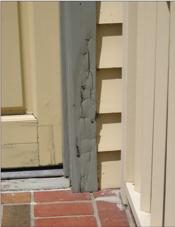
Figure 2. This residence in Historic New Harmony, Indiana, has deteriorating yellow-poplar.