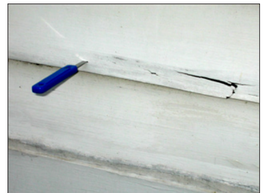
Figure 1. The decay shown in this yellow-poplar siding on a new construction started about six years after installation.

For exterior applications, where decay and insect attack were more likely, redwood and western red cedar became the preferred woods. Cypress was used in the south. The timber from old-growth stands of these species — stands that were 150 years old or more — was rated as resistant to decay and insects.