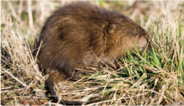
Missouri Department of Conservation

This activity familiarizes students with techniques used for assessing wildlife diversity.