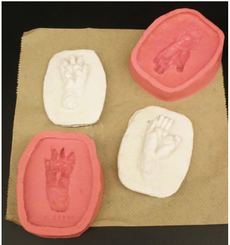
Figure 2. Completed set of track casts. (Virginia opossum shown here.)