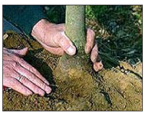
Figure 1. Root flare visible.

trunk begins to spread out as it meets the roots growing under ground. The presence of a root flare is noticeable on trees that have been planted by nature (Figure 2). Proper planting should mimic nature by keeping the trunk above ground and the anchor roots just below the surface (Figure 3). A tree without a root flare is a tree planted too deeply.