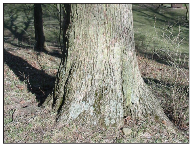
Figure 2. Trees with root flare.

A key step for proper tree planting is locating the root flare (Figure 1) which is the point where the