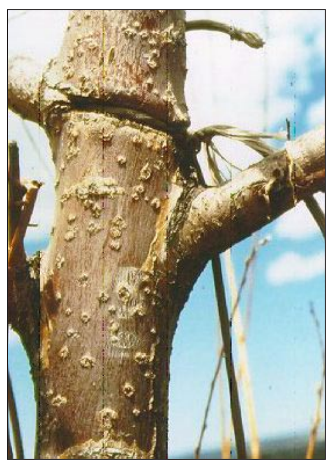
Figure 6. Guy rope girdling tree

Containerized and bare root trees. The process of planting a tree with the root flare at ground level is the same whether the tree is B&B, containerized, or bare root.