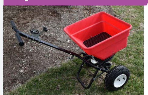
You can use a rotary-type spreader in landscape beds and around trees to apply fertilizers based on the soil test.