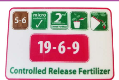
Figure 2. Fertilizer labels provide three numbers that represent the percentage of nutrients by weight. The numbers are always in the same order – nitrogen (N), phosphorus (P), and potassium (K).

But animal manures may also introduce some problems. For example, they can contain weed seeds, burn plant roots, and pollute water sources. That's why manures should always be composted before use and applied well ahead of planting time.