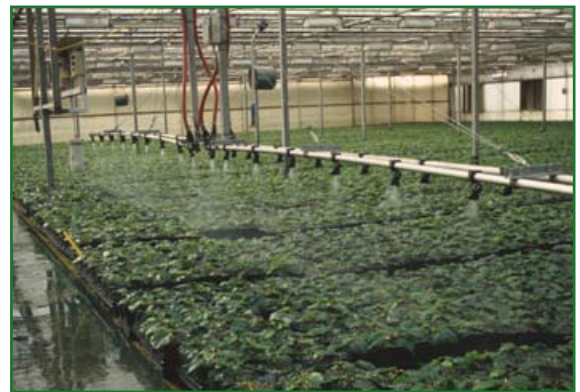
Figure 2. Mist poinsettia cuttings most frequently between 10 a.m. and 6 p.m.

After the cuttings have callused, reduce misting frequency but avoid wilting. A single application of a spreader-sticker (CapSil®) to the cuttings can reduce surface tension and water beading and promote uniform coverage of moisture across the leaf surface (Figures 3 and 4). Apply CapSil® until run-off at a rate of 300 ppm (4 fluid ounces per 100 gallons of water).