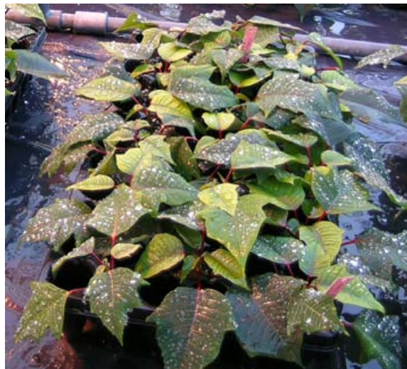
Figure 4. Without a spreader-sticker, moisture can bead on leaf surfaces.