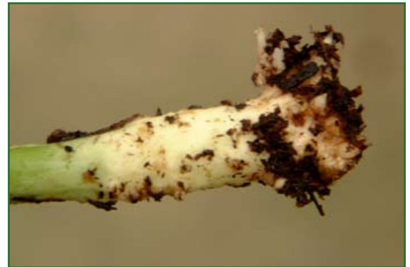
Figure 1. Callus tissue forms around the stem base seven to ten days after placing the cuttings in propagation.

The frequency of misting depends on specific system and greenhouse conditions such as light intensity, temperature, humidity, and air movement (Figure 2). Mist most frequently between 10 a.m. and 6 p.m. Nighttime misting is only required the first three to four nights.