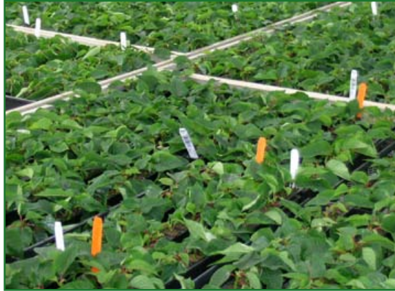
Figure 3. A spreader-sticker application can promote uniform coverage of moisture on leaf surfaces.