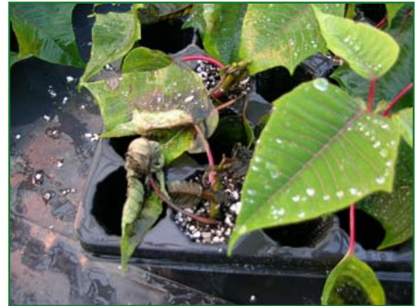
Figure 7. Botrytis on poinsettia cuttings.

Figure 1 provided by Royal Heins. All other photos by Roberto G. Lopez.