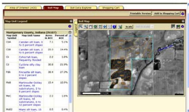
Figure 2. Screen illustrating soil map and the associated table of soil series.