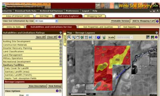
Figure 3. Illustration of soil suitability for a sewage lagoon. The red color indicates poor suitability and the yellow indicates moderate suitability.