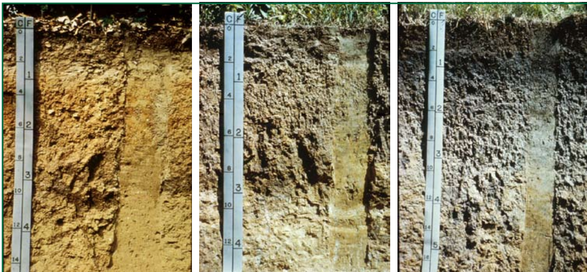
Figure 2. Soil A is well drained (oxygen rich) and does not have a seasonal water table (note the brown color). Soil C is poorly drained (oxygen deprived), and is saturated by water for most of the time (note the gray color). Soil B alternates between being saturated and oxygen rich (note the brown and gray colors).

A seasonally high water table can be problematic when siting waste management systems. During high precipitation events with low evapotranspiration, the