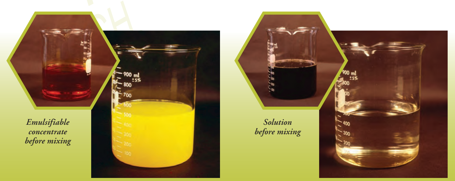
Solution after mixing

Fumigants deliver the active ingredient to the target site in the form of a gas. Some fumigants are solids that turn into a gas in the presence of atmospheric moisture. Others are liquids under pressure that vaporize when the pressure is released. Fumigants can completely fill a space, and many have tremendous penetrating power. They can be used to treat objects (e.g., furniture), structures, grain, and even soil for pest insects and other vermin. Fumigants are among the most hazardous pesticide products to use due to their inhalation danger.