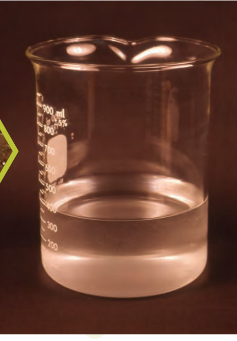
Soluble powder after mixing