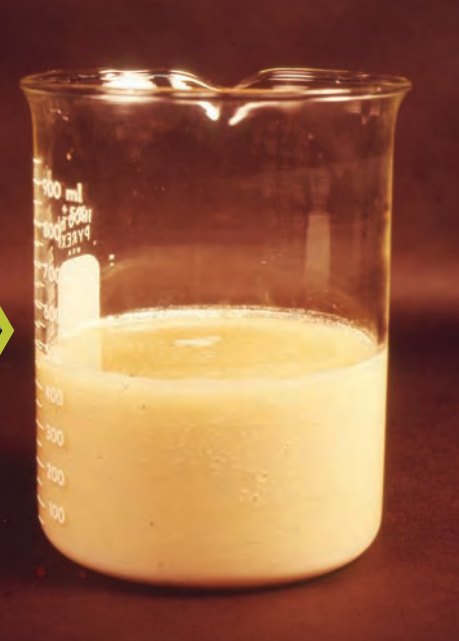
Wettable powder after mixing