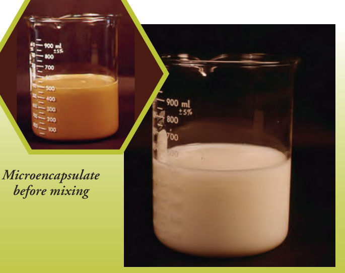
Microencapsulate after mixing