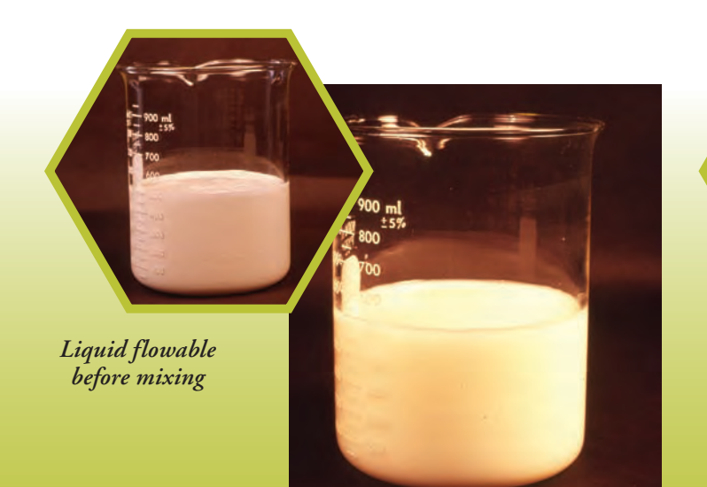
Liquid flowable after mixing

Emulsifiable concentrates consist of an oil-soluble active ingredient dissolved in an appropriate oil-based solvent to which an emulsifying agent is added. Emulsifiable concentrates are mixed with water and applied as a spray. As their name implies, they form an emulsion in the spray tank. The emulsifying agents allow oil-soluble active ingredients to be sprayed in water as a carrier. Some agitation is typically required to maintain dispersion of the oil droplets. They are not abrasive to application equipment, nor do they plug screens and strainers. Emulsifiable concentrates have several disadvantages: They present a dermal hazard; they can penetrate oily barriers like human skin; they usually have an odor problem; they can burn foliage; and they can cause the deterioration of rubber and plastic equipment parts.