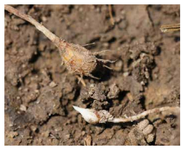
Figure 2. This image shows a mature yellow nutsedge tuber (the brown structure on top) and a yellow nutsedge tuber forming on the tip of a rhizome.

Yellow nutsedge is most problematic in turf that is mown too short, and it thrives in areas where soils remain moist from poor drainage or overwatering. However, yellow nutsedge can also be a problem in well-drained areas, especially thin turf.