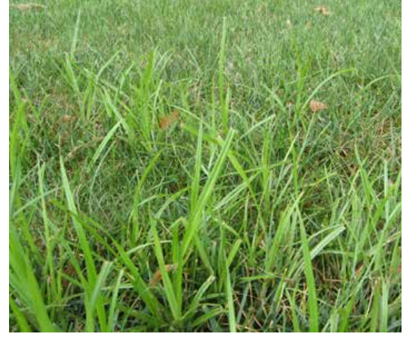
Figure 4. Yellow nutsedge grows taller than the surrounding turf during the summer.