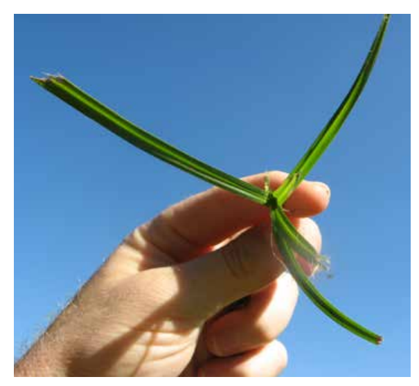
Figure 5. The three-ranked leaf arrangement of yellow nutsedge.

If only a few yellow nutsedge plants are present, hand pulling will help eliminate the weeds but will not remove the tubers in the soil. Several weeks after pulling yellow nutsedge, check the area to see if the plants have regrown from the tubers. For yellow nutsedge in landscape beds, it is best to remove the entire plant (including the root/rhizome system) by digging around the plant's base. This will help ensure that you will not get regrowth from the nutsedge's underground rhizomes.