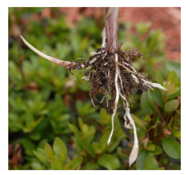
Figure 3. This yellow nutsedge plant is spreading both by a rhizome (left) and a tuber (the swollen rhizome tip at the bottom of the photo).