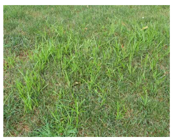
Figure 1. Yellow nutsedge is a problematic turf weed that is difficult to control.

It is important to remember that yellow nutsedge is not a grass or broadleaf weed, but a sedge. Understanding this plant's biology makes it easier to know how to best control it. This publication describes the life cycle and identification of yellow nutsedge and recommends cultural and chemical management options for homeowners.