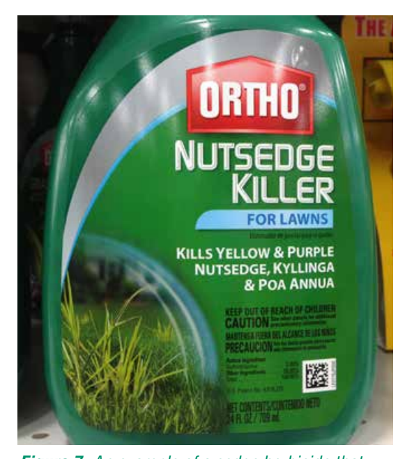
Figure 7. An example of a sedge herbicide that contains sulfentrazone.

herbicides. As the summer progresses, nutsedge plants form seedheads and tubers. Since the tubers are the plants' primary survival structure, it is critical to control nutsedge early in the summer before it produces tubers.