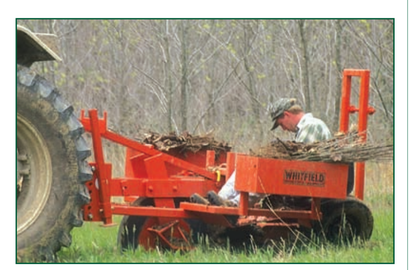
Figure 7. A mechanical tree planter suitable for planting large bare-root seedlings.

E-mail: mail@benmeadows.com Web: http://www.benmeadows.com