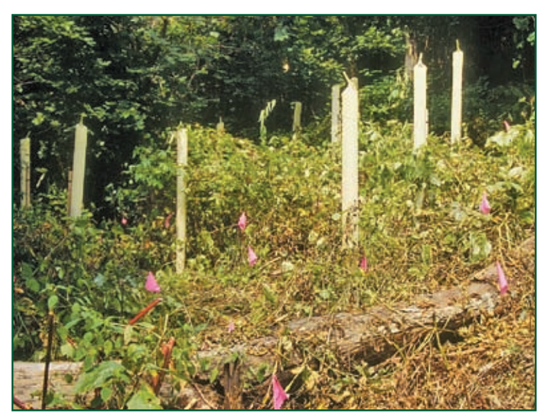
Figure 6. Tree tubes used to protect seedlings in a regeneration opening.