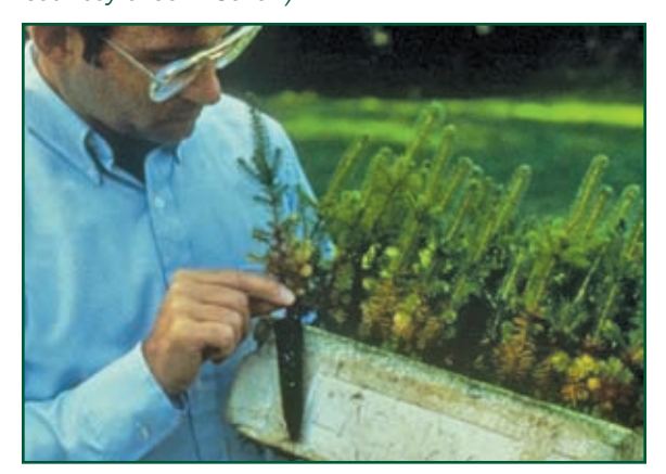
Figure 2. Containerized conifer seedlings showing the intact root system and soil plug.