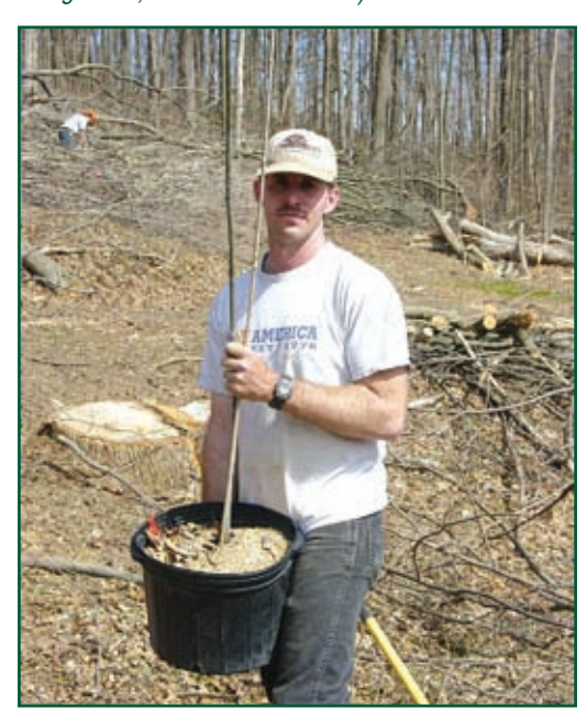
Figure 3. Large containerized hardwood seedling.

Other aggregators may be available in your area. Check the Chicago Climate Exchange listings to see who can help you market the carbon sequestered by your tree plantation or forest land. Information on trading \mathrm{CO}_2 can be obtained from the Chicago Climate Exchange at: