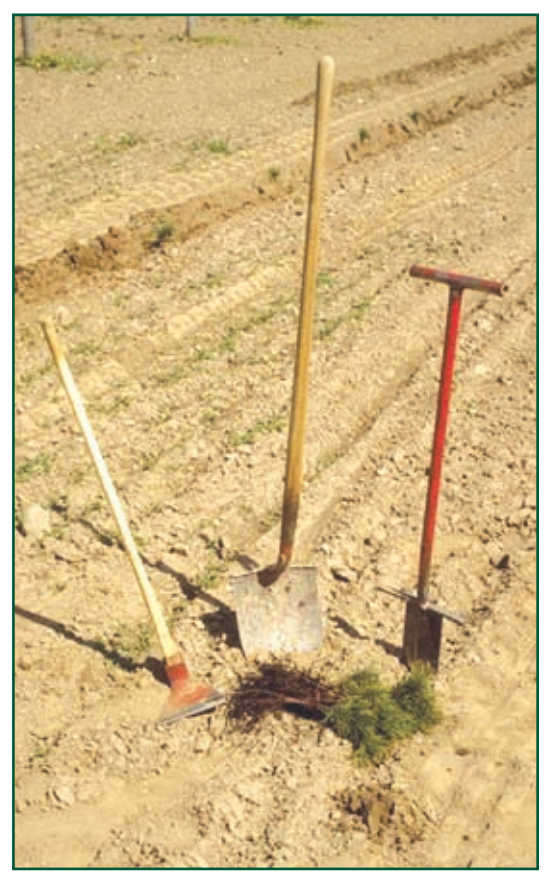
Figure 4. Tools for hand-planting tree seedlings.

The type of equipment and supplies needed for a successful tree planting will depend on factors such as, the type and size of seedlings to be planted, soil and site conditions, weed control techniques, and practices required to protect seedlings from wildlife damage. If you hire a tree planting contractor, they may be able to provide most or all of the tools and materials needed for the planting and follow-up maintenance work. If you decide to do the work, you may need some specialized equipment and supplies not readily available at the local hardware or garden store. Some of the items you may need include tree planting bars (Fig. 4), seedling planting bags, stakes or flagging for plantation layout, herbicide sprayers (Fig. 5), herbicides or pesticides, tree tubes, weed barriers, and fencing. These and other related items are available from forestry equipment companies.