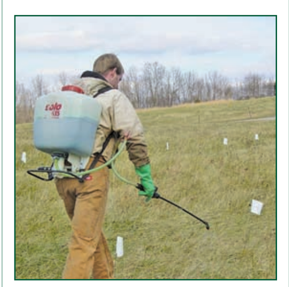
Figure 5. Backpack sprayer for weed control treatments.