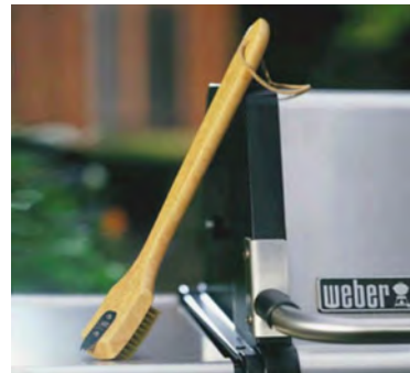
Grill Brush — A Brush with a long handle on the end that is used to clean a grill to reduce remove food debris.