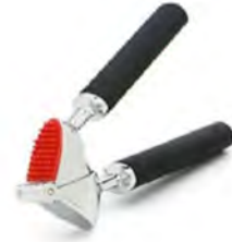
Garlic Press — A press used for extracting juice from garlic