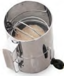
Flour Sifter — A utensil used to incorporate air into flour and other dry ingredients