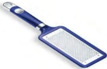
Grater — A device with sharp edged holes against which reduces it to shreds. Used to grate such things as cheese.