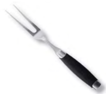
Kitchen Fork — A utensil used to lift or turn small food