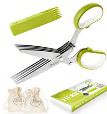
Herb Scissors – Scissors designed with five blades and used to cut herbs. These multi-blade scissors quickly cut herbs into thin strips (sometimes called chiffonades). Stainless steel blades cut cleanly, without tearing or bruising delicate leaves.