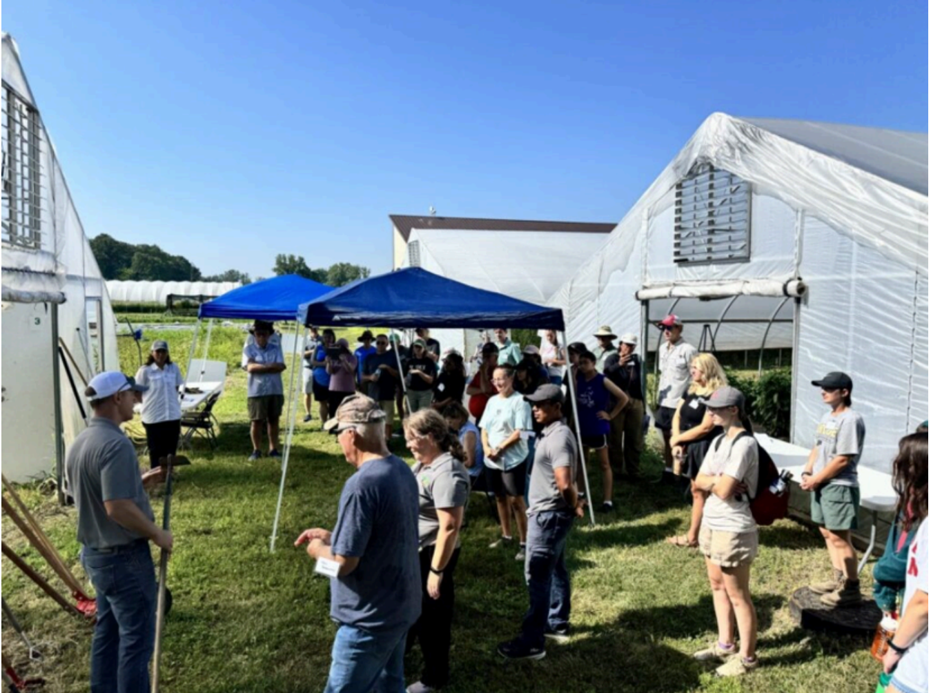
2025 Purdue Small Farm Education Field Day, West Lafayette, IN