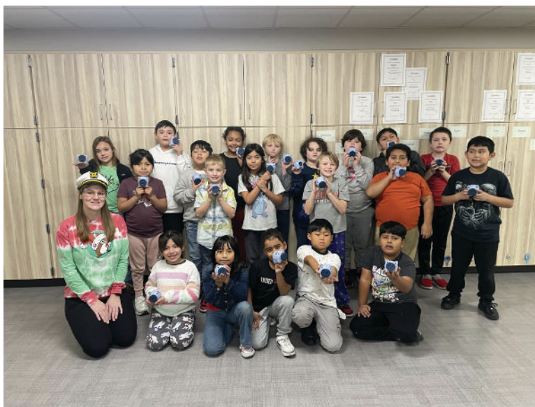
Some Captain Cash graduates at Fairview Elementary with their piggy banks.

www.extension.purdue.edu/Cass CassCES@purdue.edu