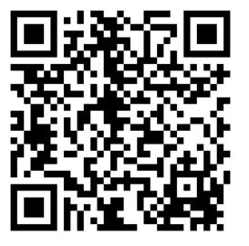
https://bit.ly/2025fcauction To register for the Floyd County 4-H Auction & Dinner, use the link or QR Code above.

Thank you for your previous participation in the Floyd County 4-H Auction! You are invited to the 2025 Auction on Friday, June 13 at 6:30 p.m., with dinner beginning at 5:30. This is a premium only auction meaning that what you bid is what you pay. This auction is an important event that shows the 4-H youth of Floyd County how much you appreciate all their hard work as a positive member of our community. To register, please see below.