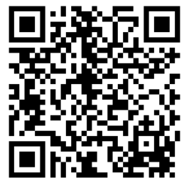
https://bit.ly/2025fcauction To register for the Floyd County 4-H Auction & Dinner, use the link or QR Code above.

Thank you for your previous participation in the Floyd County 4-H Auction! You are invited to the 2025 Auction on Friday, June 13 at 6:30 p.m., with dinner beginning at 5:30. This is a premium only auction meaning that what you bid is what you pay. This auction is an important event that shows the 4-H youth of Floyd County how much you appreciate all their hard work as a positive member of our community. To register, please see below.