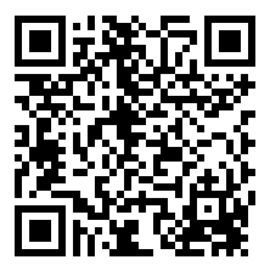
https://bit.ly/2025fcauction To register for the Floyd County 4-H Auction & Dinner, use the link or QR Code above.

Thank you for your previous participation in the Floyd County 4-H Auction! You are invited to the 2025 Auction on Friday, June 13 at 6:30 p.m., with dinner beginning at 5:30. This is a premium only auction meaning that what you bid is what you pay. This auction is an important event that shows the 4-H youth of Floyd County how much you appreciate all their hard work as a positive member of our community. To register, please see below.