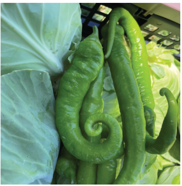
Peppers and cabbage harvested for donation from Our Community Garden - a Purdue Extension Floyd County project