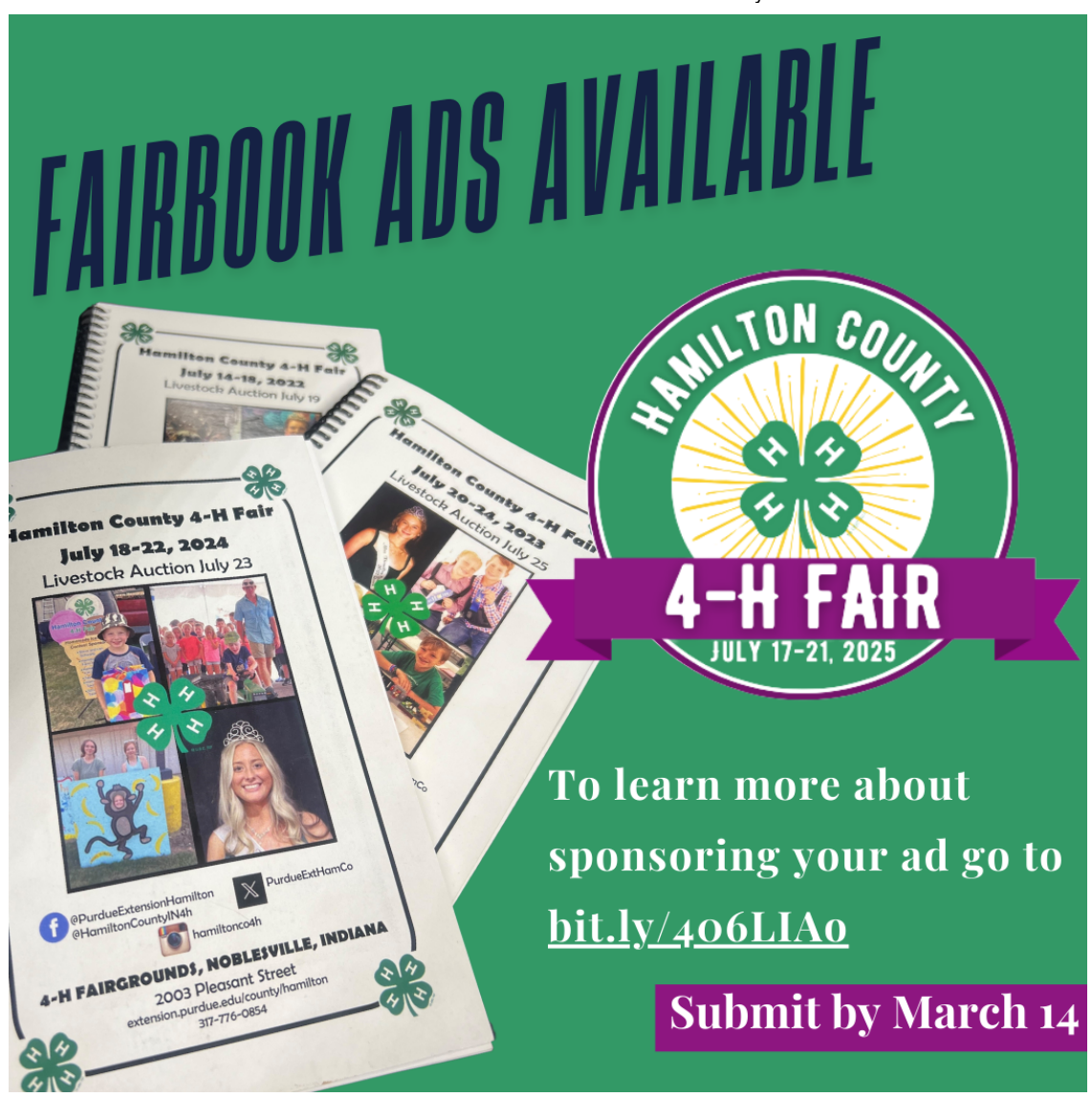
Activities & Opportunities