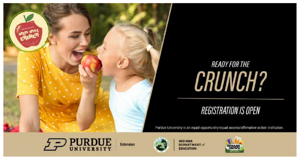
Please Join Us! Register your 4-H Club for the Great Lakes Great Apple Crunch

What is the Crunch? A celebration of <u>National Farm to School Month!</u> Please help Indiana celebrate by purchasing, supporting, and crunching into locally and regionally grown apples at NOON on Thursday, October 10, 2024 (or any day in October). Incorporate educational activities and videos into your Crunch day! Registered Crunch participants will receive a link to the 2024 Indiana Crunch Guide with all the info they need!