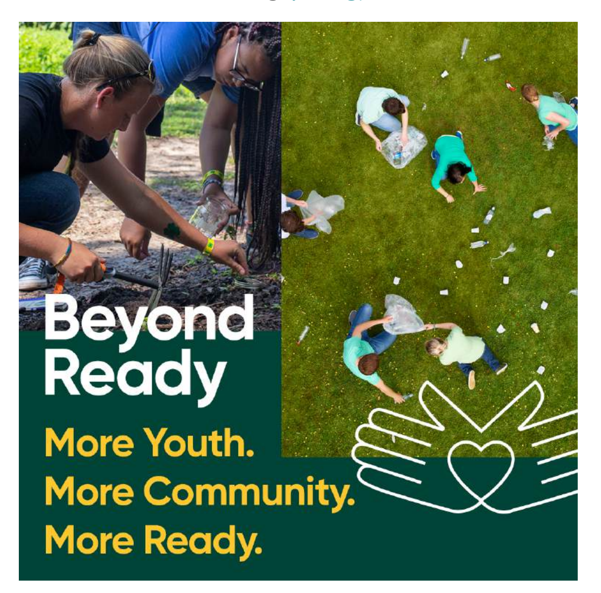
National 4-H Week is October 7-12, 2024

Questions? Contact Laura Dodds @ LjDodds@purdue.edu