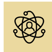
Leadership & Civic Engagement