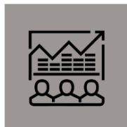
Community Economics & Workforce Development