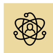
Leadership & Civic Engagement