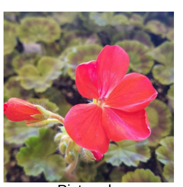
Pictured: Above: Red Seed Geraniums Below: Purple and White Petunias

You may purchase flowers by ordering them though your local Hendricks County 4-H Members or by calling 317-745-9260 or email hendrces@purdue.edu.