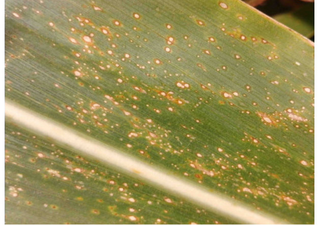
Characteristic Curvularia leaf spot symptoms on a corn leaf.