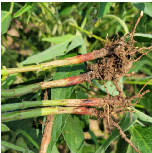
Red crown rot stem discoloration.