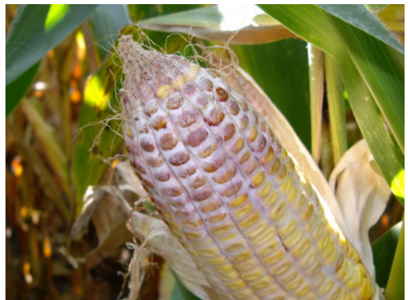
Pink mold on the ear characteristic of Gibberella ear rot.