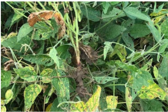
Foliar symptoms of red crown rot.