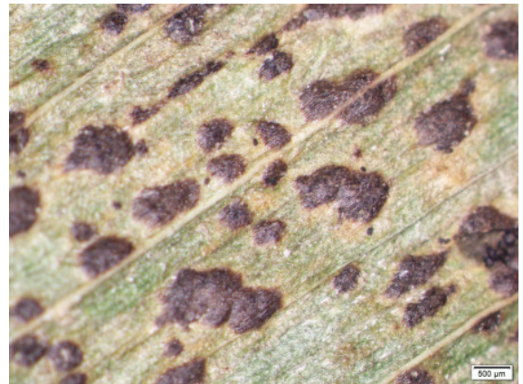
Fungal fruiting structures characteristic of tar spot.