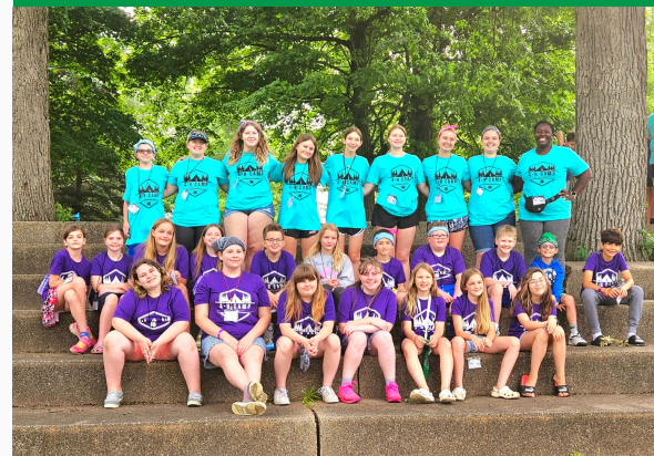
Group photo from 4-H Camp

Camp counselors - June 9-12th Campers - June 10-12th