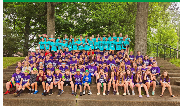
Group photo from 4-H Camp

It's time to start planning for State and National 4-H Opportunities: 4-H Round-Up, Citizenship Washington Focus, 4-H Academy @ Purdue, State 4-H Band & Chorus, 4-H Junior Leader Conference, Day at the Statehouse, and more! Check out photos of past events at bit.ly/photosin4h Dates and links to more information are on the Indiana 4-H Website.