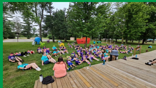
Group photo from 4-H Camp

2024-25 Indiana 4-H Policies and Procedures are now available at bit.ly/3AkZ8kP