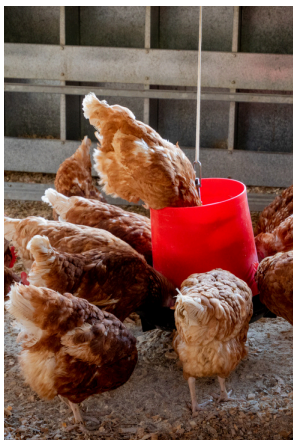
Exhibit one poultry, any sex or age. You may exhibit and show your own poultry bird all week at fair.