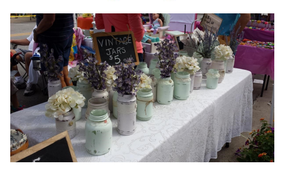
2024 Colonel Vawter Day