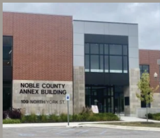
Noble County Annex building, Albion In