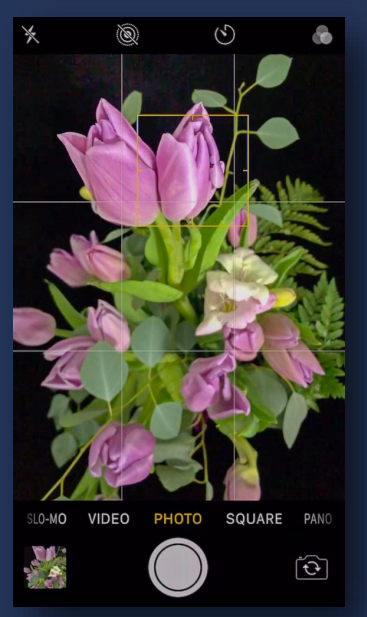
Focus iPhone 1: Tap the iPhone's screen to block your subject.