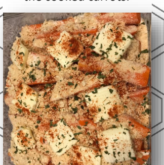
Top with crumbs, butter, paprika and parsley.