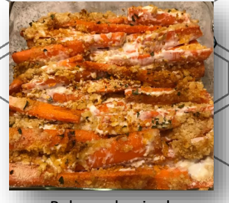
Bake and enjoy!