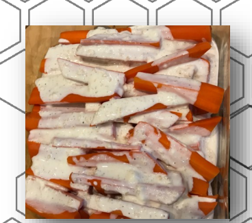
Pour mayo mixture over the cooked carrots.

Notes: This is a drier version of the recipe. If you prefer a creamier dish, you can double the sauce ingredients only. This can be made a day ahead. Just bring it to room temperature before putting in the oven.