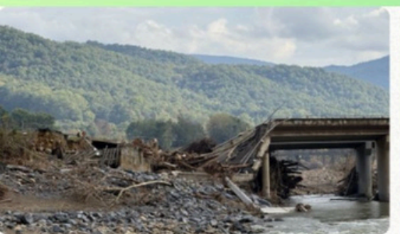
Can you see the men working on this bridge? Helps you to understand their devastation.