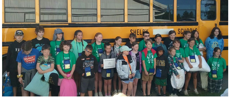
Shelby County 2024 4-H Campers boarding the bus to 4-H camp!

It is hard to believe it is already time for the April/May edition of our newsletter! With it getting closer to summer that means 4-H Camp is quickly approaching! If you are in grades 3-6 you have been mailed a letter with registration and camp information. This is a wonderful opportunity and I highly encourage you to check it out! Camp dates are: May 28-31, 2025 at Camp Shakamak State Park in Jasonville, IN. Fee is $125 and includes camp fees, insurance, park admission, t-shirt and transportation. I would like to thank Shelby County 4-H Advisory Council for their generous donation in providing $50 scholarships for each first year camper. If you do receive a camp scholarship, you would only owe a camp fee of $75! Such a great deal! If you have any questions, please let me know! Shelby County is allotted 30 campers, so be sure to be in the first 30 to submit paid registrations for camp! Registrations due by May 9th! We have SIX camp counselors going this year and those are: