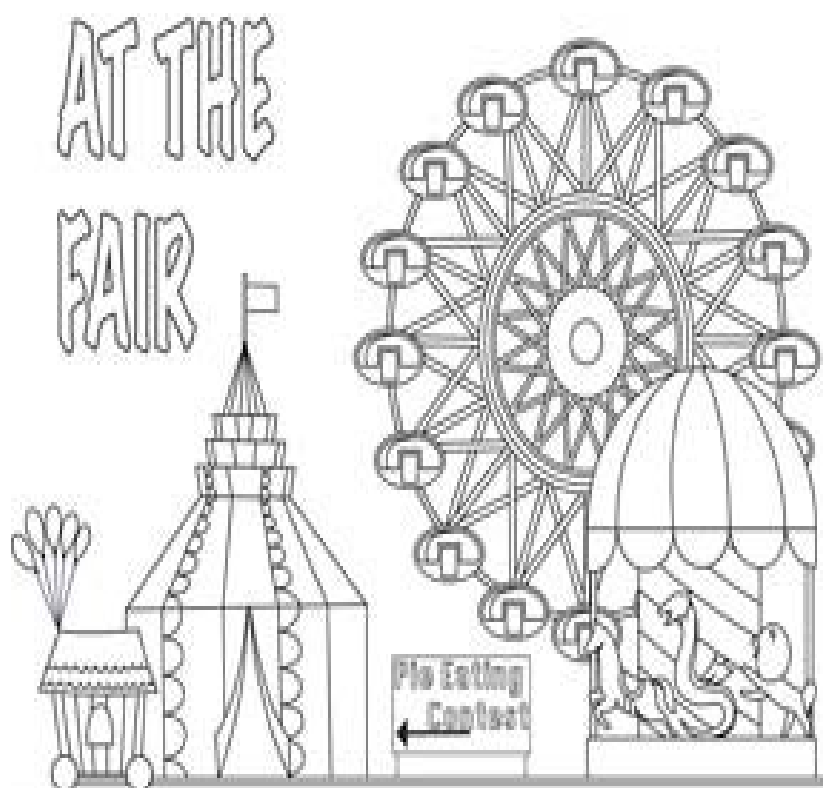
Coloring Contest Ages 6 to 8