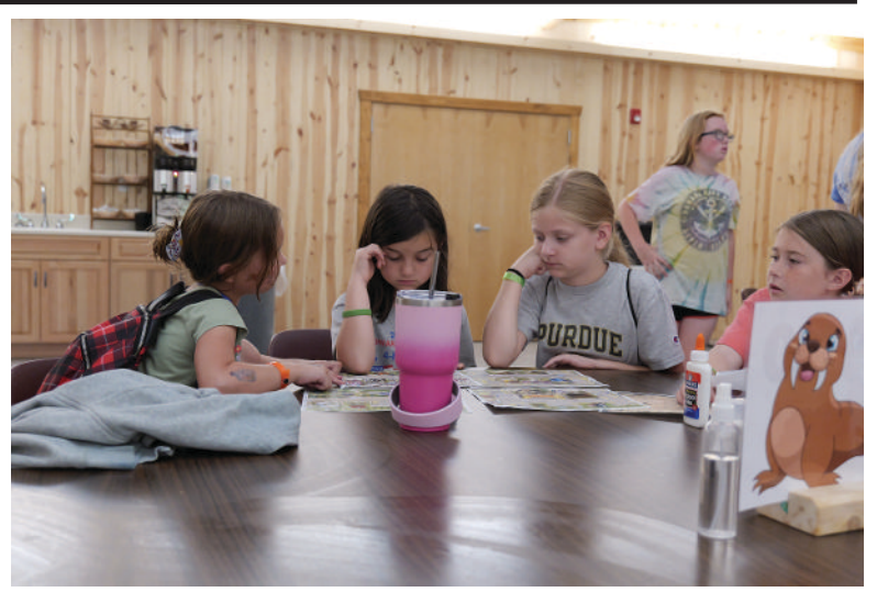
Campers doing an escape room activity at Camp Tecumseh during 4-H Camp.