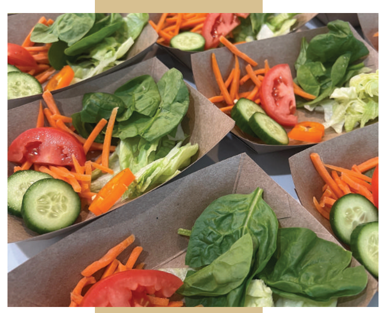
Veggie wrap prep!