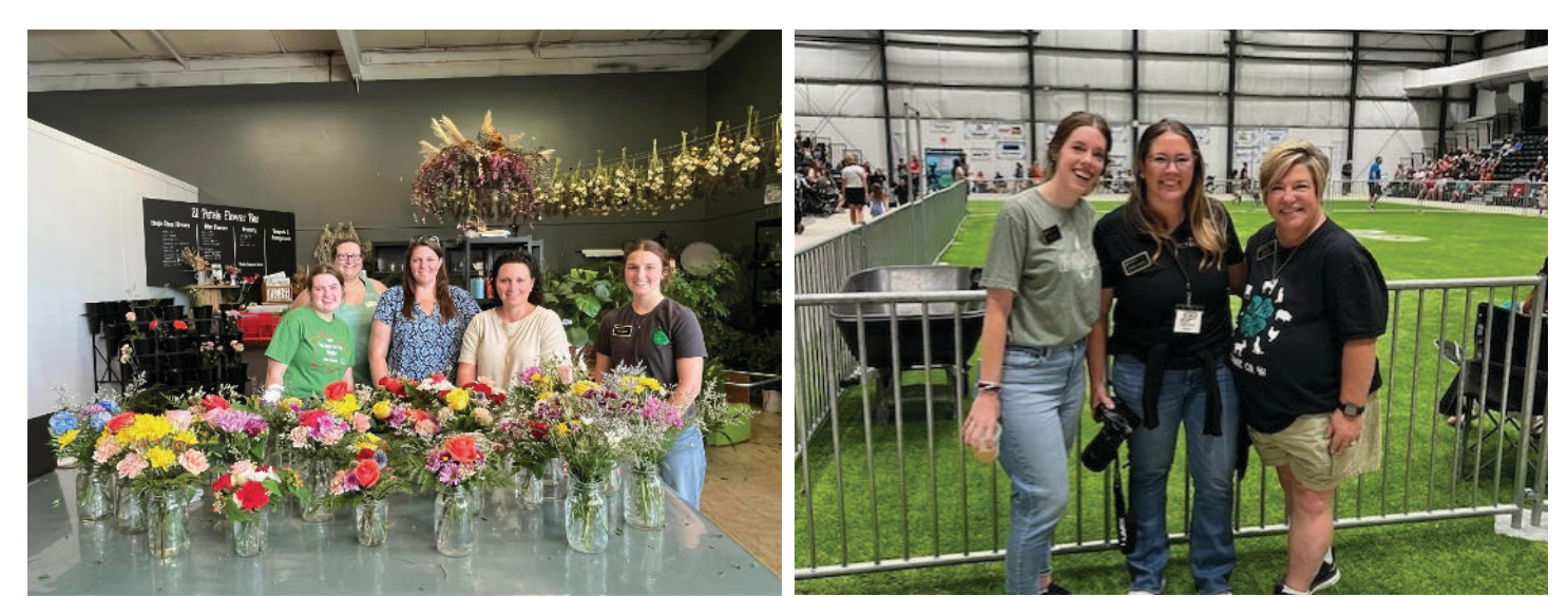
Our staff and volunteers partnered with 21 Petals to create flower arrangements for the tables at the Tippecanoe County 4-H Fair.