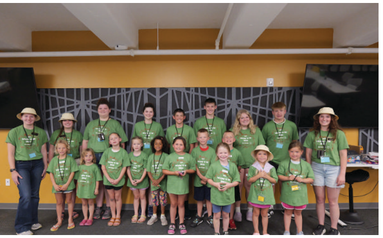
The interns and Junior Leaders with the kindergarten group for Mini 4-H Camp.