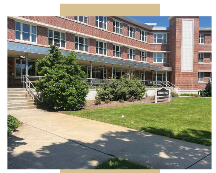
Purdue University's Meredith Hall where classes for PALS took place.