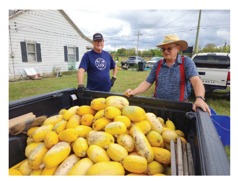
Partcipants helping to harvest the squash in one of the local gardens.

Learn more and get involved at applecrunchin.com.