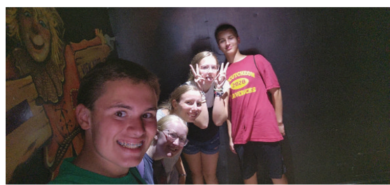
Junior Leaders enjoying their day at Holiday World.