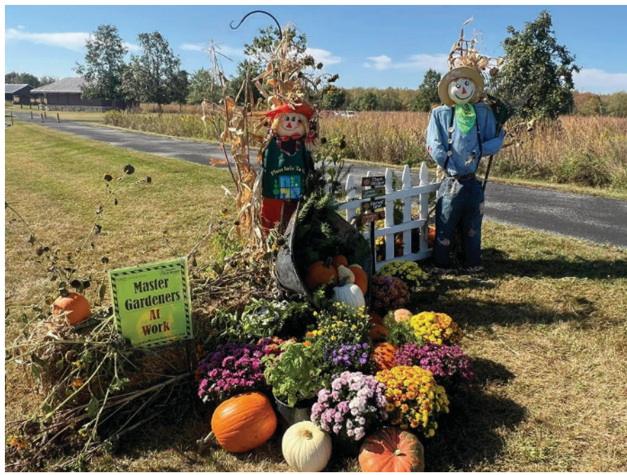
Master Gardener's scarecrow exhibit at Prophetstown State Park.