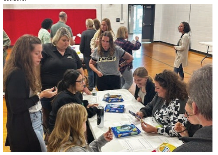
Educators participating in an Oreo activity at their Area 9 meeting.