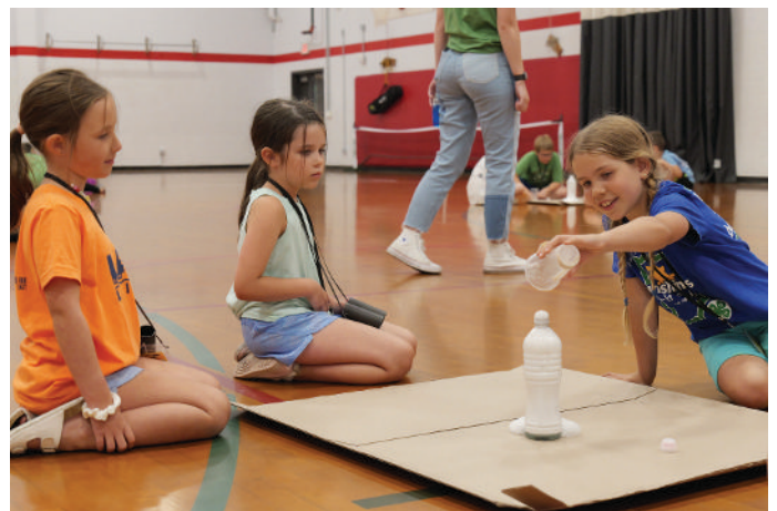
Mini 4-H participants during the 2024 Mini 4-H Camp.