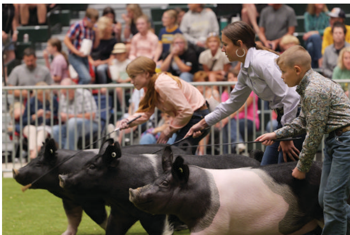
4-H participants during the 2024 Tippecanoe County 4-H Fair.