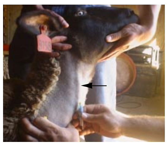
Figure 3. Notice how the animal's eye lines up with its vein (see arrow).

The easiest way to locate the vein is to draw an imaginary line from the middle of the animal's eye down the side of its neck (Figure 3). The vein can be located by applying pressure with the thumb or fingers below the half-way point of the