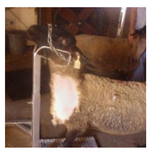
Figure 2. This picture shows the area that should be sheared and a sheep being restrained in a blocking stand.

Correctly position the animal for shearing. Use electric shears to shave a patch approximately 4 inches wide by 8 inches long. Figure 2 shows an example of a sheep with a larger patch size for descriptive purposes. Shaving an area allows for easier viewing of the vein and provides a clean area in order to minimize the chance of introducing dirt or bacteria into the vein with the needle.