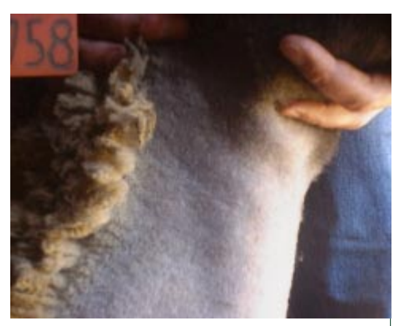
Figure 4. The animal's neck will look like this before pressure is applied to the vein.