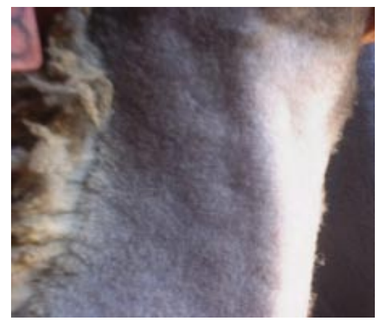
Figure 5. The animal's vein will look like this after pressure has been applied.

shaved area. The pressure will cause the vein to pop up and be easy to see. The photographs in Figures 4 and 5 illustrate what the vein looks like before and after pressure.