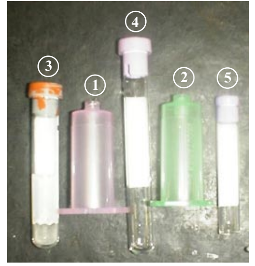
Figure 1. Some of the equipment that can be used in blood sampling sheep is shown in this picture. (#1 and 2 are vacutainer needle holders and #3, 4, and 5 are vacutainers.)

The syringe, needle, vacutainer, and surgical scrub can be acquired from a veterinarian or an animal health supply company.