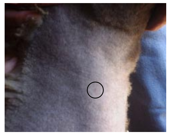
Figure 7. The circle in this picture is surrounding a dot that shows where the needle was removed from the animal.

up onto the needle. If the needle is in the vein, blood will start to fill the container immediately. If this does not happen, gently move the needle so that the tip comes to the outside of the vein wall and re-insert. Gentle prodding may be needed to achieve maximum blood flow. Before removing the needle, be sure to remove your left hand, which applies the pressure to prevent blood from exiting through the insertion site. Also, before removing the needle, be sure to remove the vacutainer to prevent the loss of the vacuum in the tube. If the needle is removed from the skin, the vacuum will be lost and a new blood collection tube will be needed. After the needle has been removed from the skin, press your fingertip over the area where the needle was inserted. A small red dot may appear on the animal's neck from where the needle was removed (Figure 7). This is normal and is nothing to be concerned about.