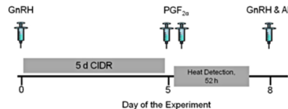
Figure 2: 5 day CO-Synch + CIDR Protocol

5 day CO-Synch + CIDR: Heifers assigned to the 5-day CO-Synch + CIDR protocol received 100 µg of GnRH and a CIDR on experimental day 0. On day 5 CIDR were removed and heifers were administered PGF 2α . All heifers in the 5 day CO-Synch + CIDR treatment received a second 25 mg injection of PGF 2α approximately 12 h after the initial injection.