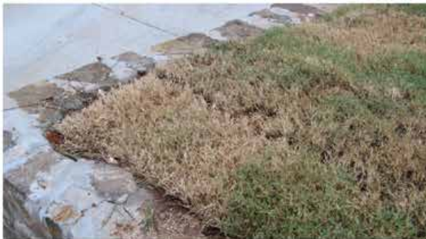
C. The edges of this sod dried after installation.