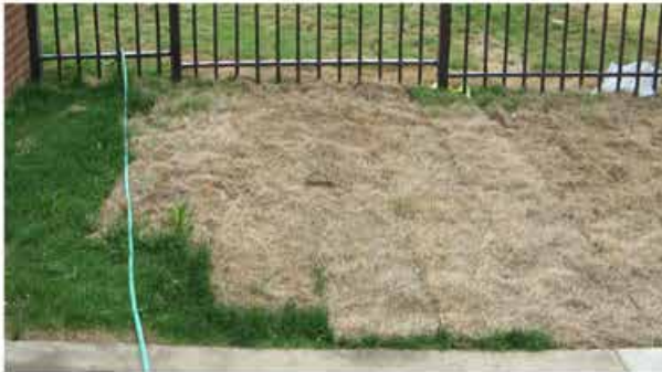
A. This lawn received inadequate irrigation after the sod was installed.