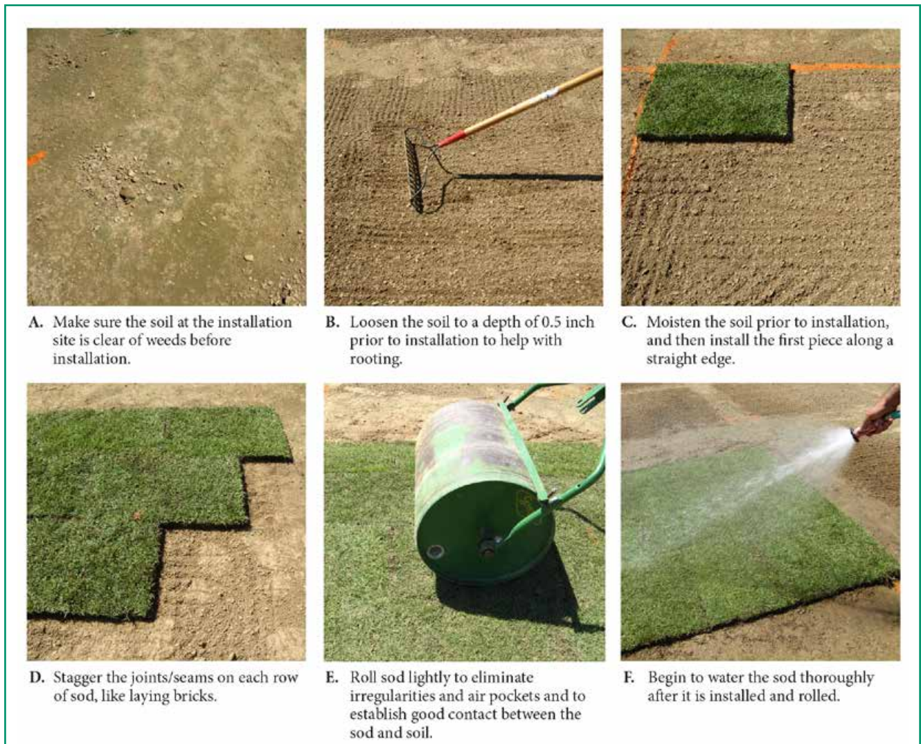
Figure 3. These photos show the steps for preparing a site and installing sod.

within 10 to 14 days if temperatures are optimal and the sod is kept moist. Irrigate dormant sod as needed to keep it moist despite the fact it is not actively growing. Lack of irrigation is the number one reason dormant sodding is unsuccessful. Monitor soil moisture throughout the winter until new roots develop in early spring.