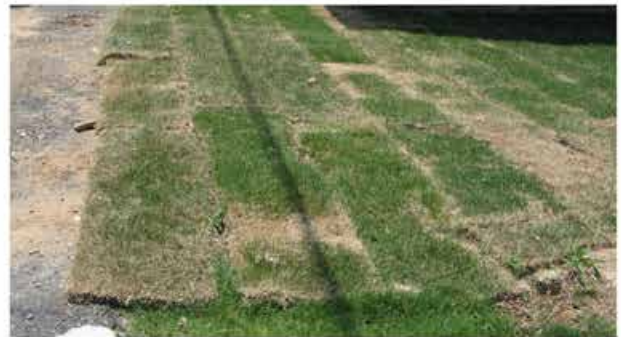
B. This lawn received inadequate irrigation after the sod was installed.