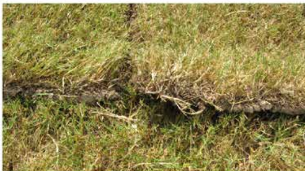
E. Overlapping these sod seams during installation caused desiccation.