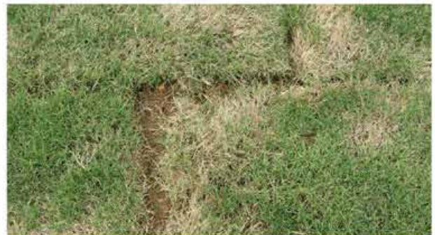
F. There was too much space between these sod seams, which caused drying.