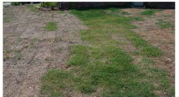
D. This bermudagrass sod was laid in early winter and suffered winterkill due to insufficient irrigation during winter (left and right). Some areas were resodded in late winter and survived (center).