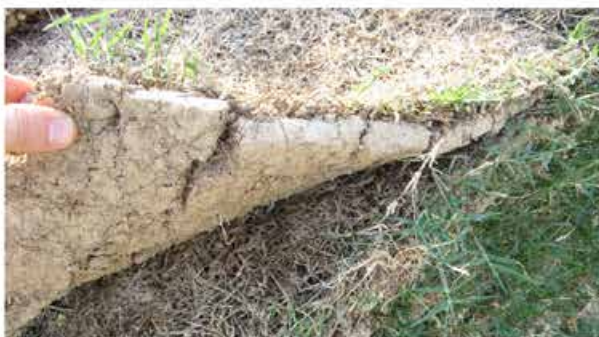
G. Waiting too long to install sod can dry it out. Do not purchase sod more than 24 hours after it has been harvested, and always plant fresh material.