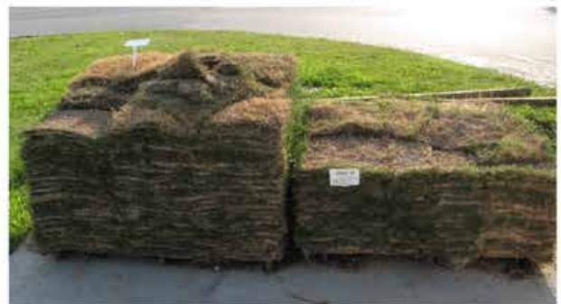
H. Waiting too long to install sod can dry it out. Do not purchase sod more than 24 hours after it has been harvested, and always plant fresh material.