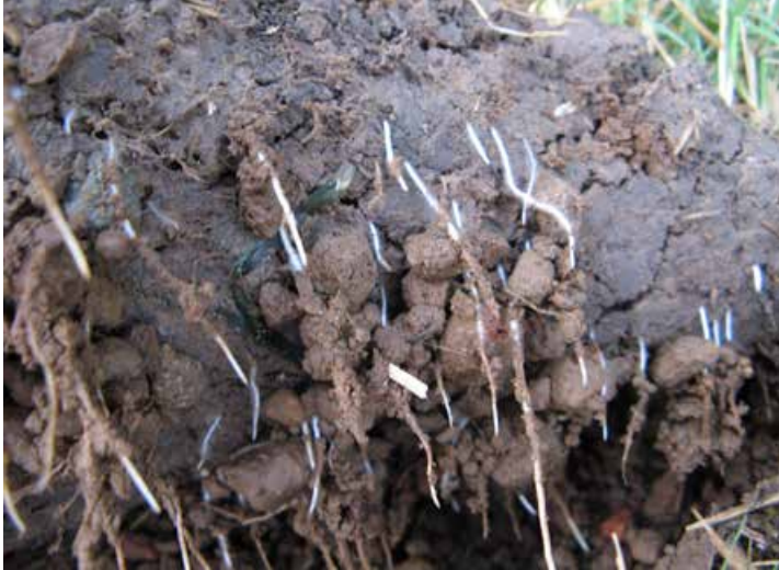
Figure 4. Newly initiated roots, which are white, are typically visible a few days after planting sod.

One pound of nitrogen per 1,000 square feet is a good target rate to use after planting, but you should use less if you planted the sod in summer. Delay nitrogen fertilizer applications until April or May (after full green-up) if you installed the sod in the winter.