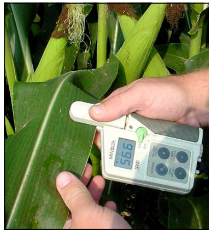
Figure 1. A chlorophyll meter in use

factors other than the N content of the leaf. These include hybrid differences, leaf age, stresses related to other nutrient deficiencies or excesses, leaf diseases, insect damage, weather and so forth. Studies in Indiana have shown 50% to 70% differences in greenness between commonly grown commercial corn hybrids. Table 1 shows an example from a Purdue University experiment. Hybrid C had 11% lower SPAD readings when fully fertilized than Hybrid A at the V8 growth stage but yielded 11 bushels more per acre.