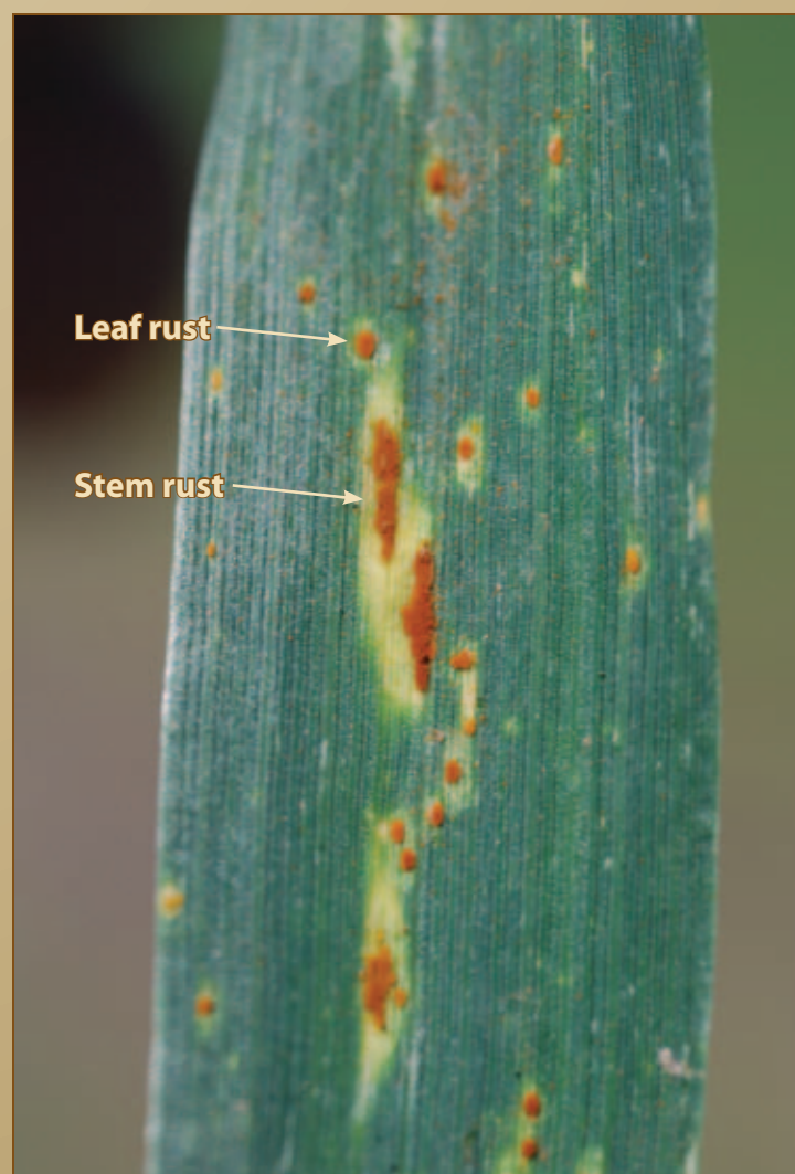
Figure 2. Comparison of the stem rust and leaf rust lesions on leaf tissue. Note the larger diamond shape of the stem rust relative to leaf rust.

Differentiating the rust diseases can be difficult, but with practice they can be reliably identified. Begin by considering broad characteristics such as which plant parts are affected (Figure 1) or arrangement of the blister-like lesions on plants. These characteristics will often separate one or more of these diseases quickly. Continue by examining less obvious characteristics including lesion size, shape, and color to either confirm the diagnosis or separate the more similar diseases. For example, stripe rust is the only one of these diseases to have the blister-like lesions organized into stripes on the leaves (left). If the lesions are scattered on the affected plant parts, both stem rust and leaf rust are a possibility and additional characteristics must be considered. Leaf rust typically causes small, round lesions on the leaf blades and leaf sheaths. In comparison, stem rust causes oval or elongated lesions and is capable of infecting nearly all aboveground parts of the plant, most notably the true stems (Figure 2).