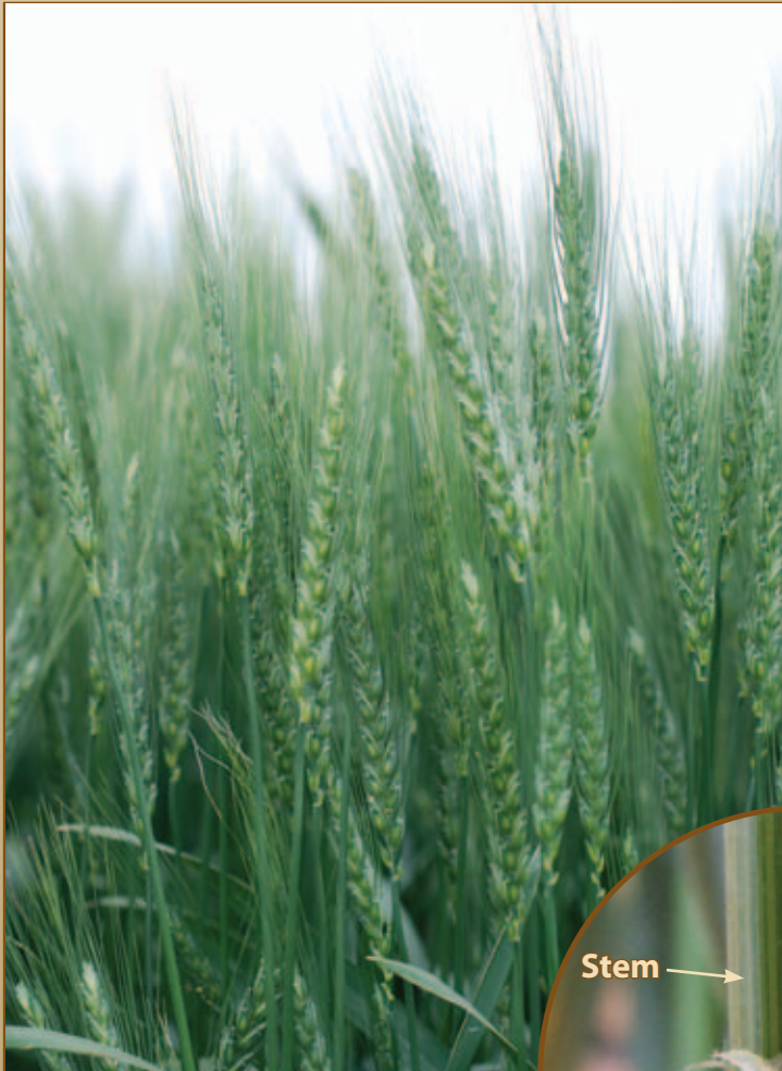
Figure 1. The diagnosis of rust diseases requires some basic understanding of plant anatomy and a quick review of this information may improve the accuracy of the identification process.

depends on host susceptibility and weather conditions, but the loss also is influenced by the timing and severity of disease outbreaks relative to crop growth stage. The greatest yield losses occur when one or more of these diseases occur before the heading stage of development. Early detection and proper identification are critical to in-season disease management and future variety selection.